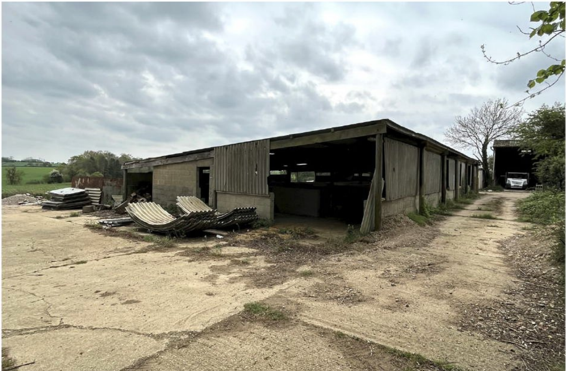
Photo 5. B1 north side, showing surrounding hardstanding

Negligible bat roost potential. Further action is recommended in terms of avoiding nesting birds.