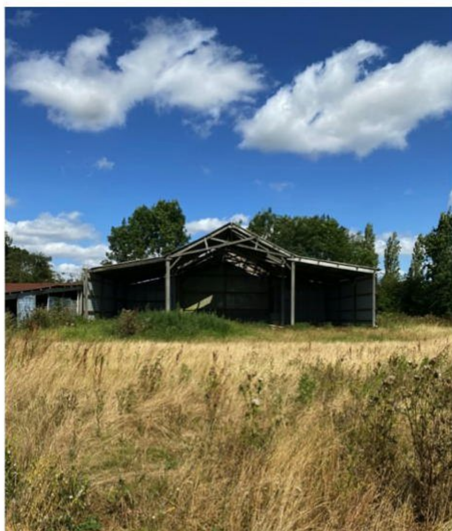
Photo 1. Species-poor semi-improved grassland south of barn B2

Only a very small section of this habitat, to the southeast of B2, will be impacted by the proposed development. Whilst the semi-improved grassland is suitable habitat for reptiles, the small section to be impacted is unlikely to support any more than a few individuals, if present. However, further action is recommended to avoid the potential of impacting reptiles and nesting birds (see below).