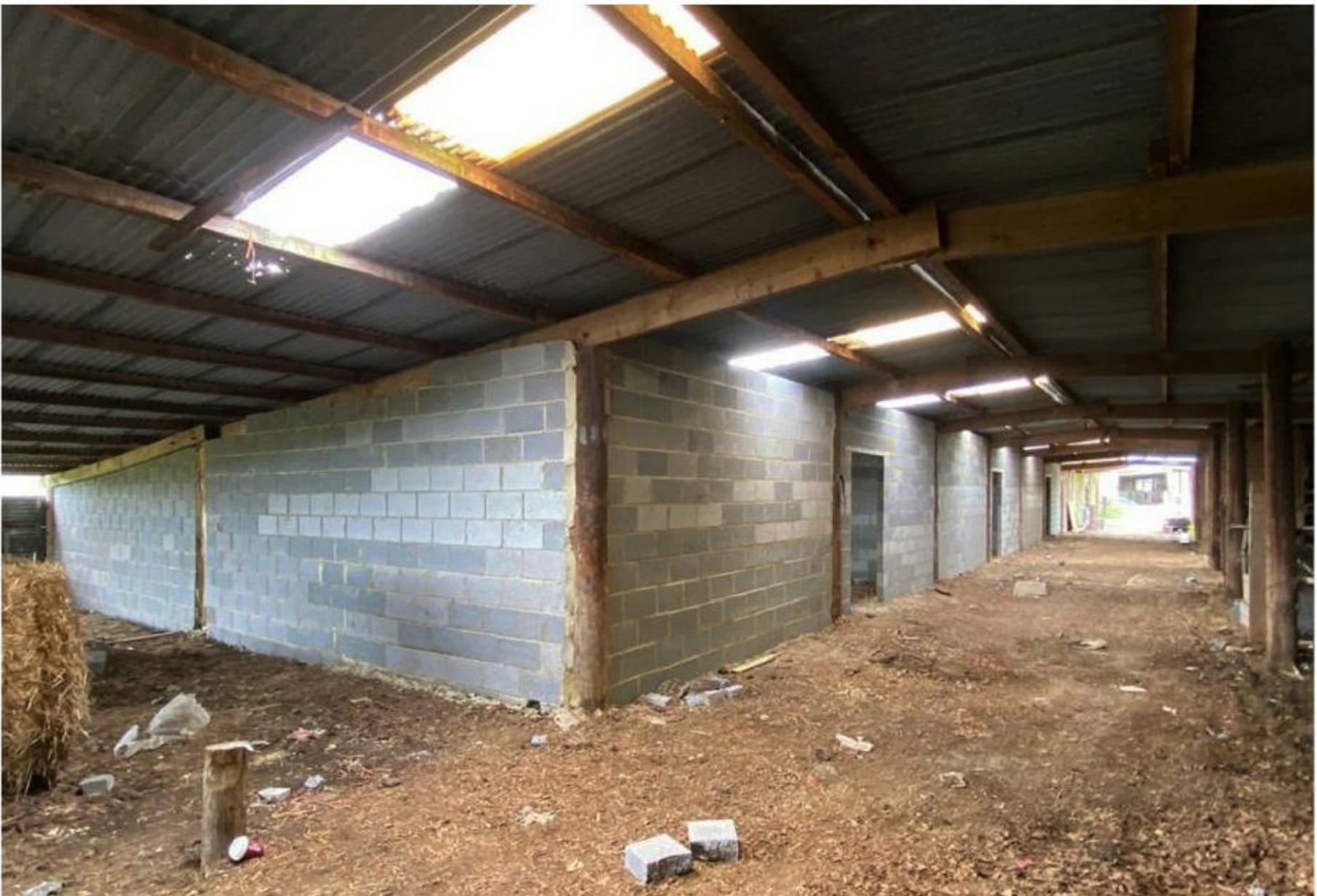
Photo 9. Interior of B3