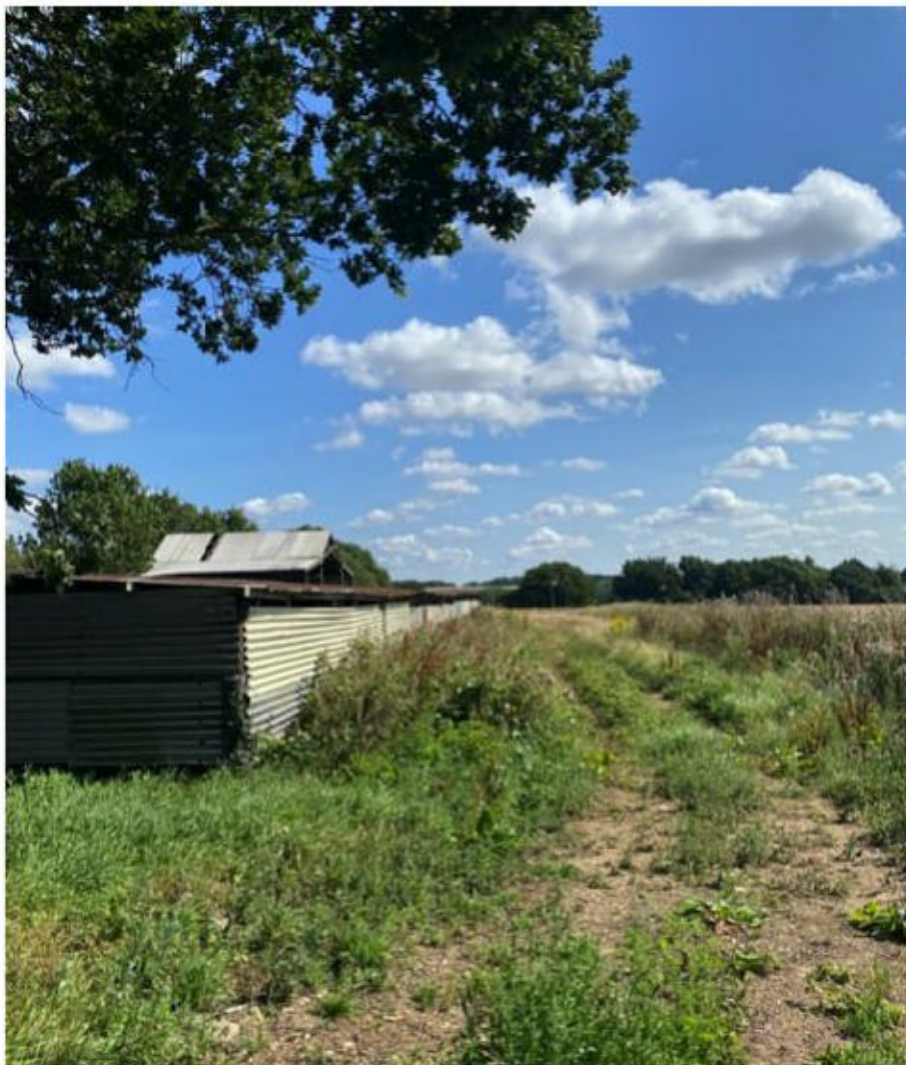
Photo 2. Tall ruderal vegetation south of the Turkey Barn B3

Sections of this habitat are likely to be impacted by the proposed development. Whilst this habitat is sub-optimally suitable habitat for reptiles and nesting birds, the small sections to be impacted are unlikely to support any more than a few individuals, if present. However, further action is recommended to avoid the potential of impacting reptiles and nesting birds (see below).