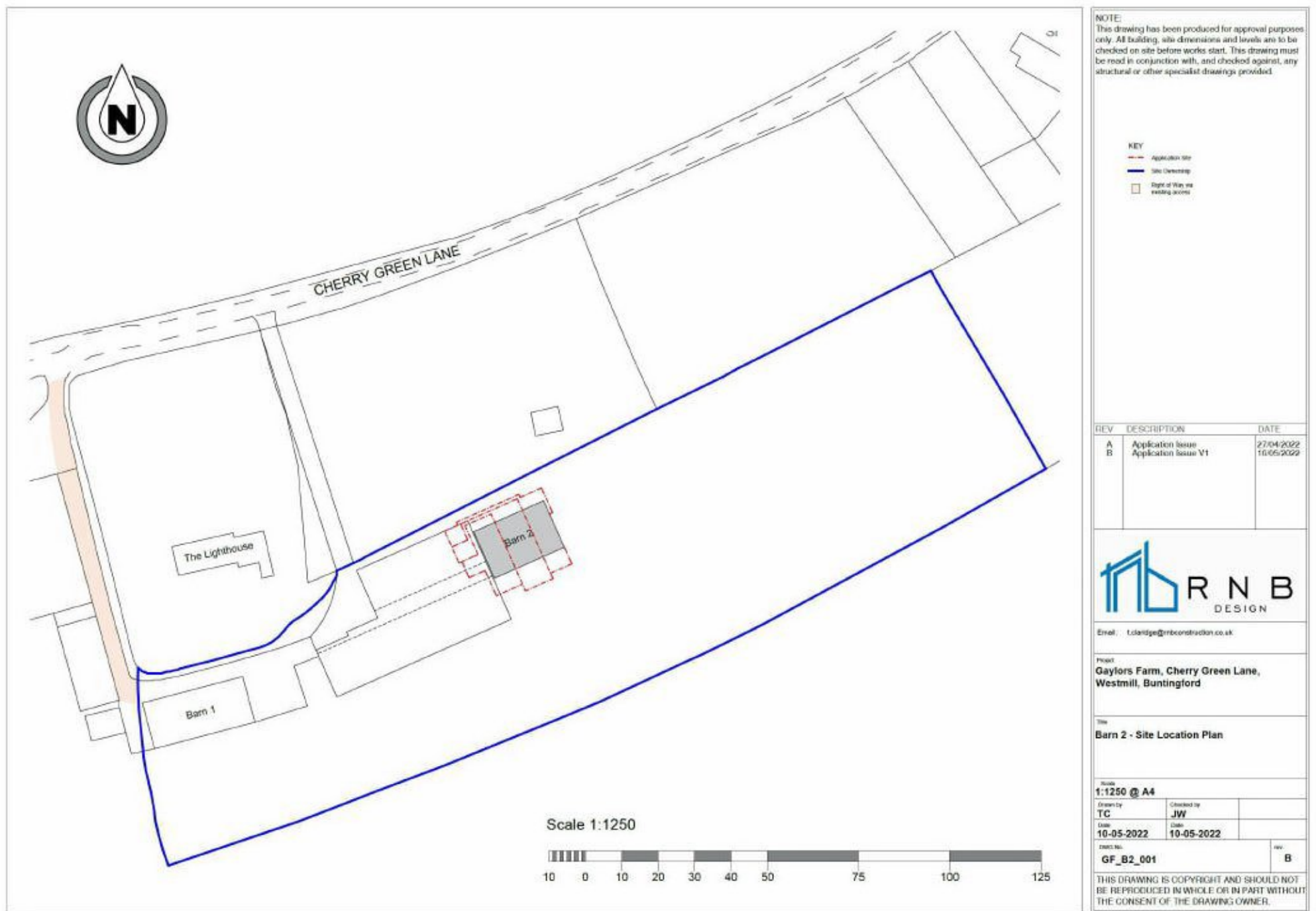
Figure 1. Existing site with dashed red lines showing limit of proposed development and wider land ownership outlined in blue.