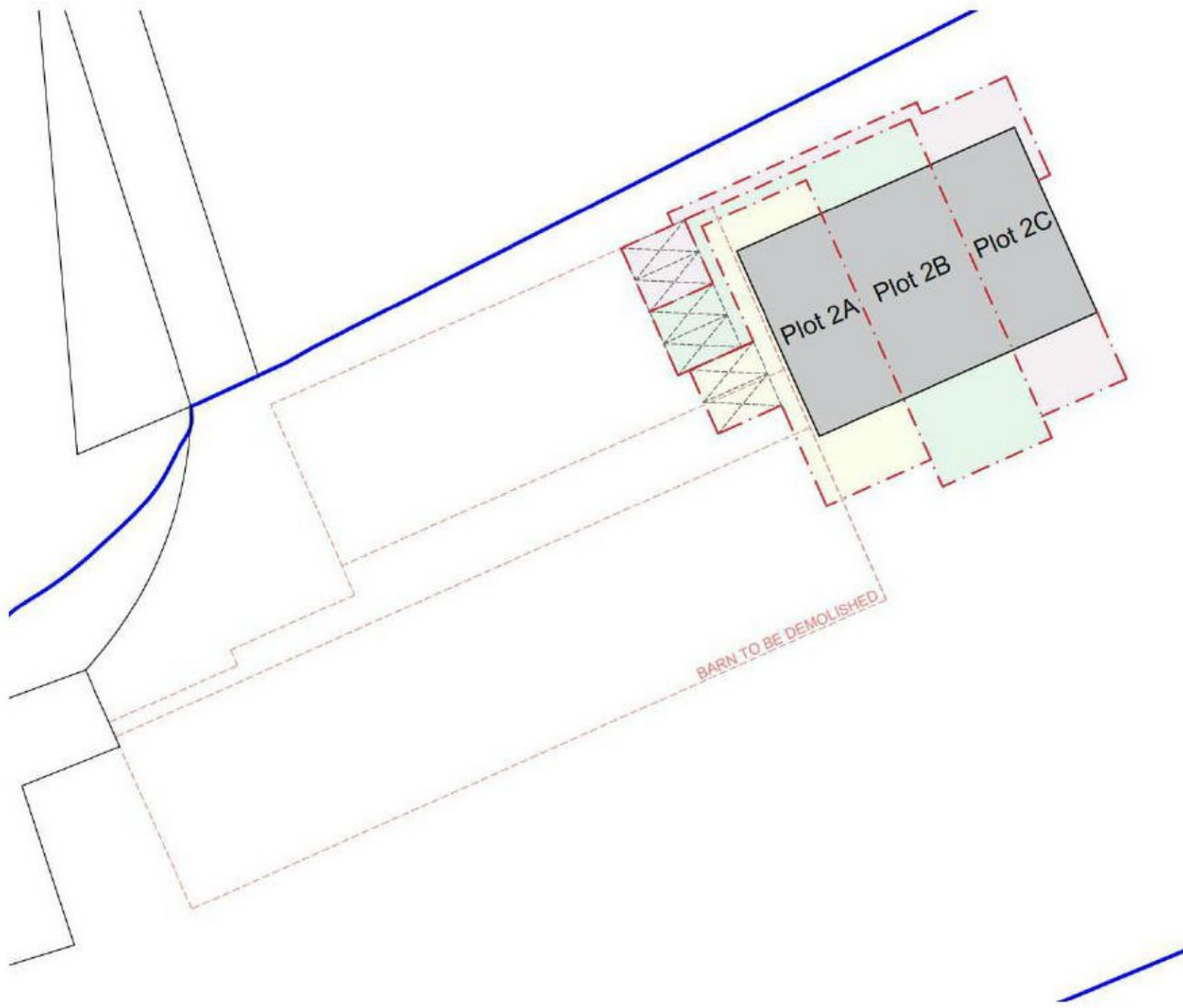
Figure 3. Proposed layout plan for Barn 2 (B2). Note that the barn to the west/southwest (B3, also known as the Turkey Barn) will be demolished and replaced with soft landscaping, with a small area replaced by parking areas for the new units.