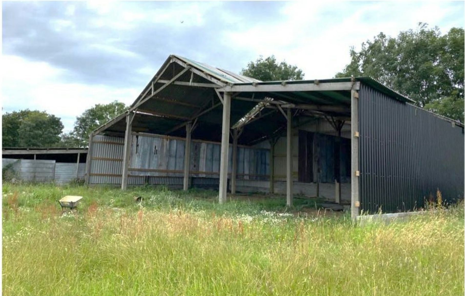
Photo 7. Barn 2 (B2) taken from the southeast corner looking northwest