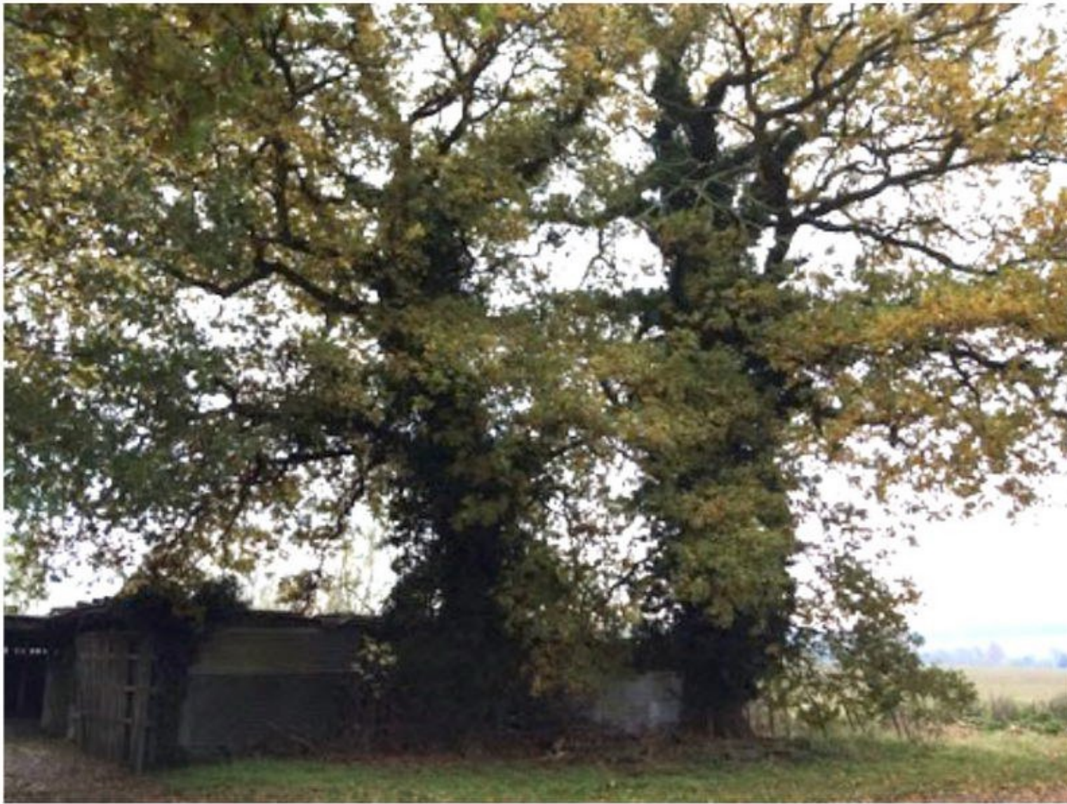
Photo 3. Mature oaks at western end of B3, to be retained