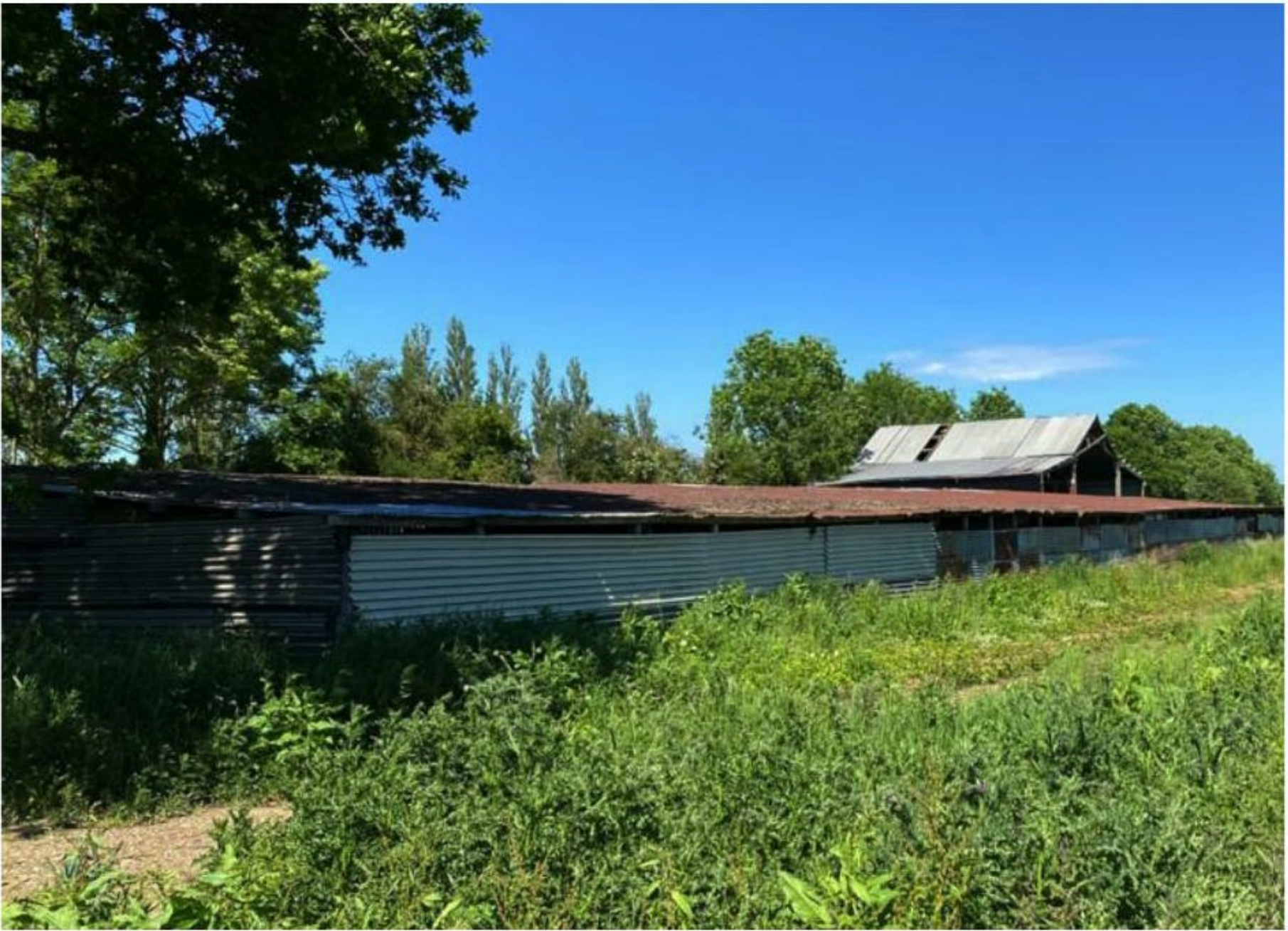
Photo 8. Exterior of the Turkey Barn (B3) to be removed, taken at southwest corner of building looking northeast, with Barn 2 (B2) in the background