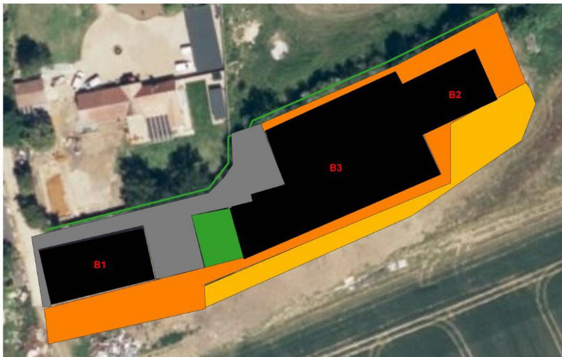
Figure 5. Map of Phase 1 habitats on the site, with buildings labelled as noted in the text

Supplementary planting of the defunct hedgerow and new hedgerow planting are recommended.