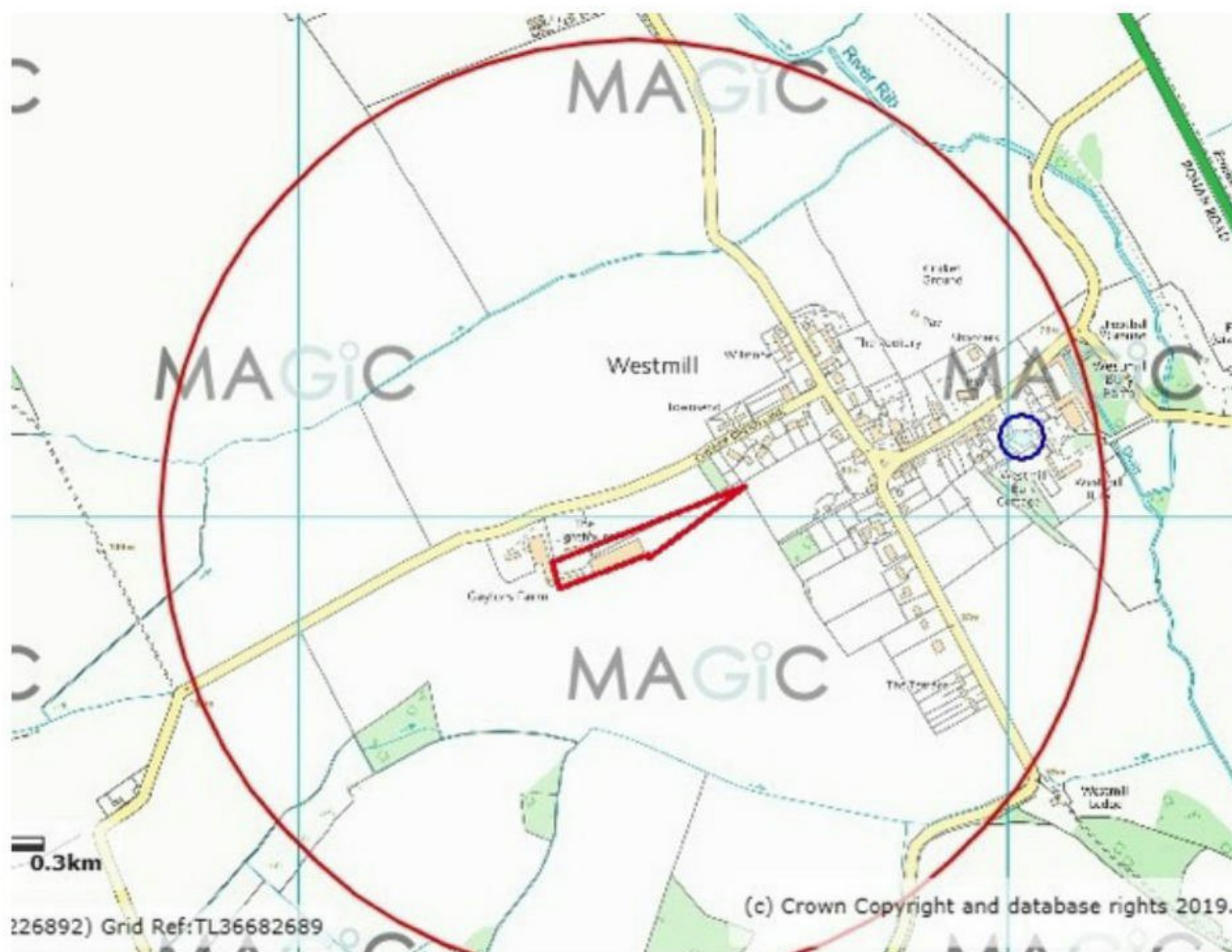
Figure 4. Site (within the land ownership area outlined in red) with a 500m buffer zone (red circle) and pond (circled in blue)

A pond was identified to the east, approximately 415m from the site (location shown in Figure 4 below). Great crested newts tend to stay within 500m of their breeding pond. There was a minor road in between, which would not serve as a significant barrier to newt movement. However, the pond was separated from the site by a number of houses and gardens, providing a significant barrier to great crested newt movement (particularly in terms of garden fences and walls). The intervening gardens also provide good quality terrestrial newt habitat, which would discourage great crested newts from venturing further to the more distant site. As such great crested newt was scoped out of further survey.