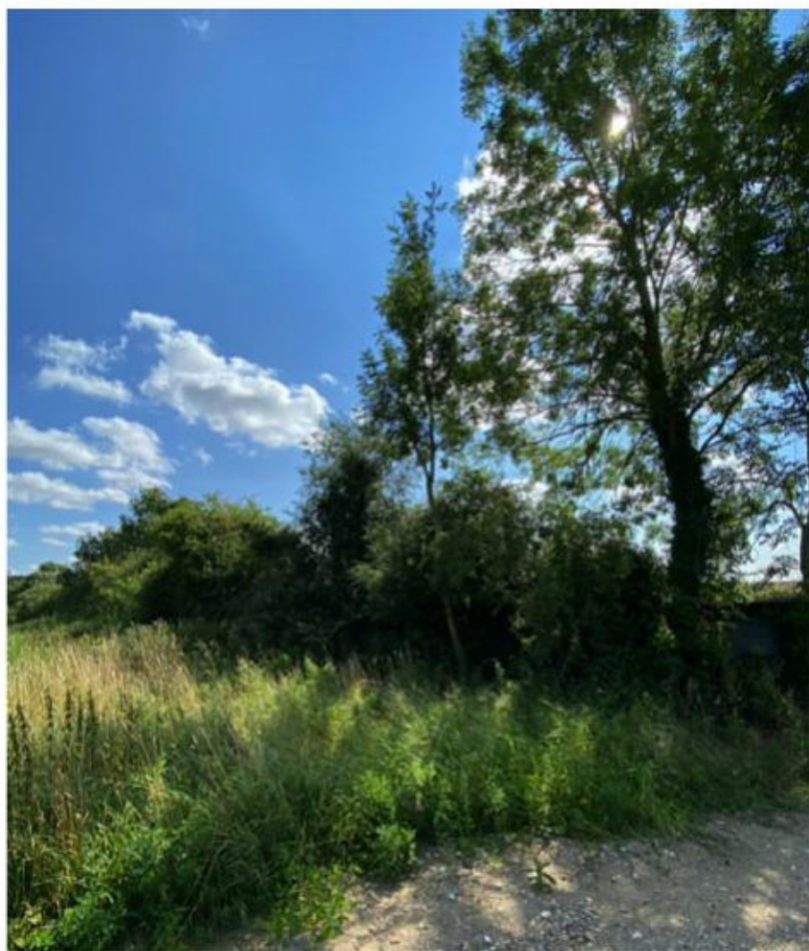
Photo 4. Species-poor defunct hedgerow with trees, north of barn B2

A line of young ash Fraxinus excelsior and the remains of a defunct hawthorn Crataegus monogyna hedge ran along the northern site boundary. To the east and off-site, this merged into a species-rich hedgerow with trees. These trees and hedgerow are to be retained.