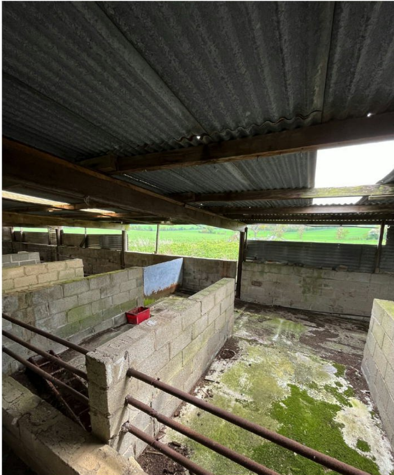
Photo 6. B1 internal