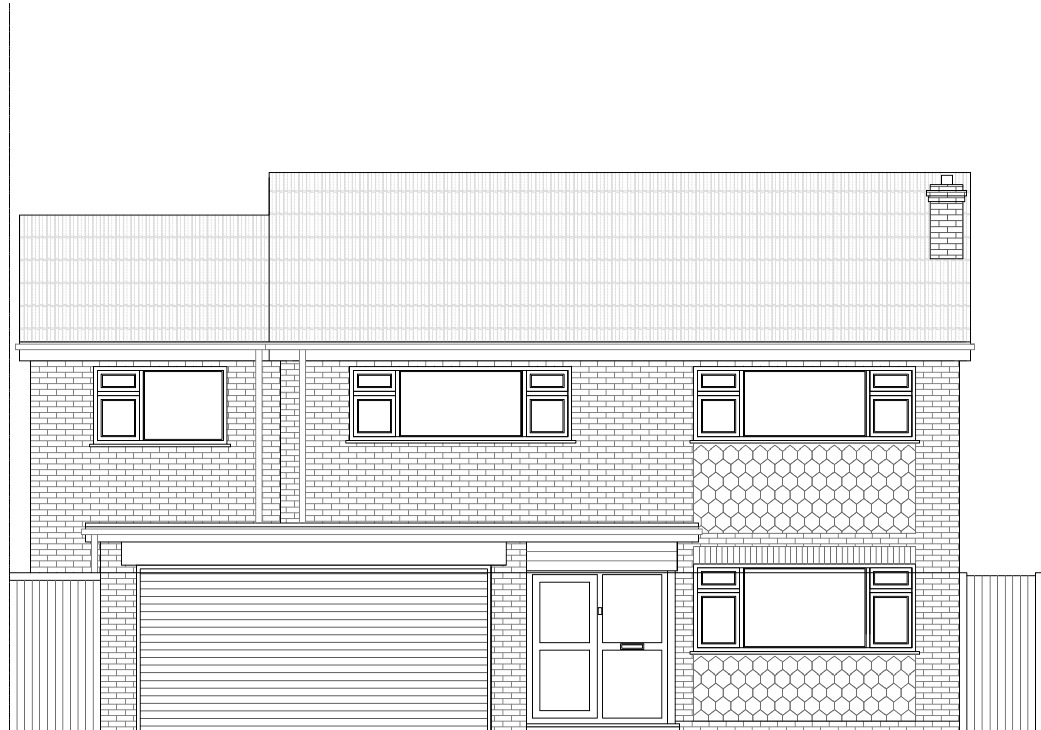
PROPOSED ELEVATION 1