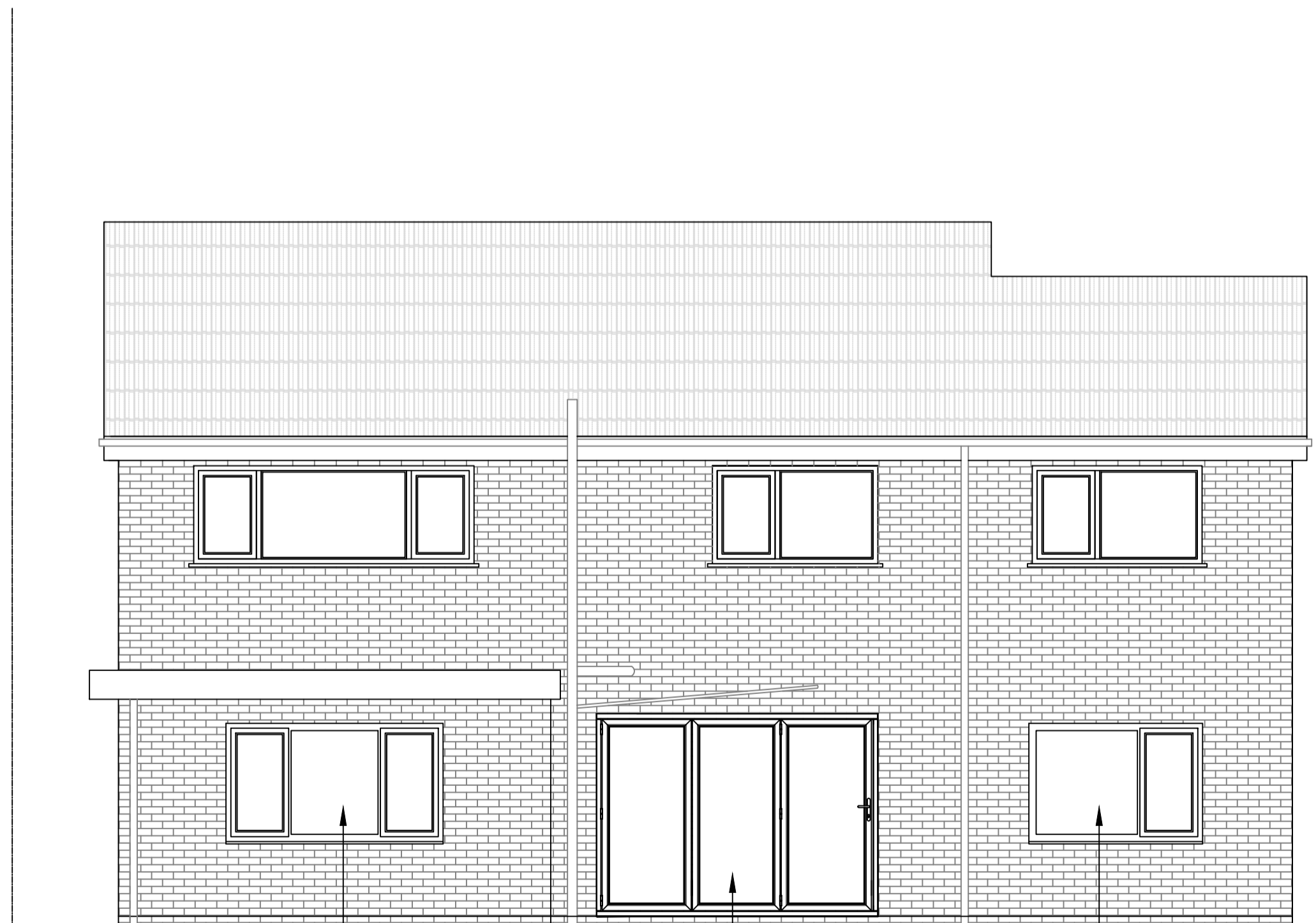
PROPOSED ELEVATION 3