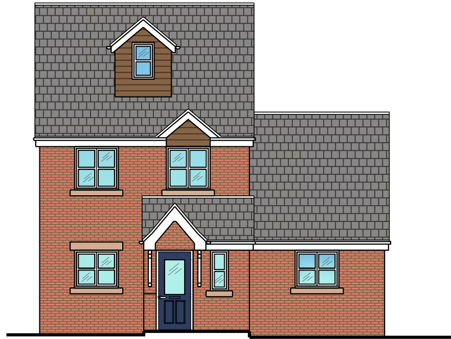
FRONT ELEVATION / SECTION