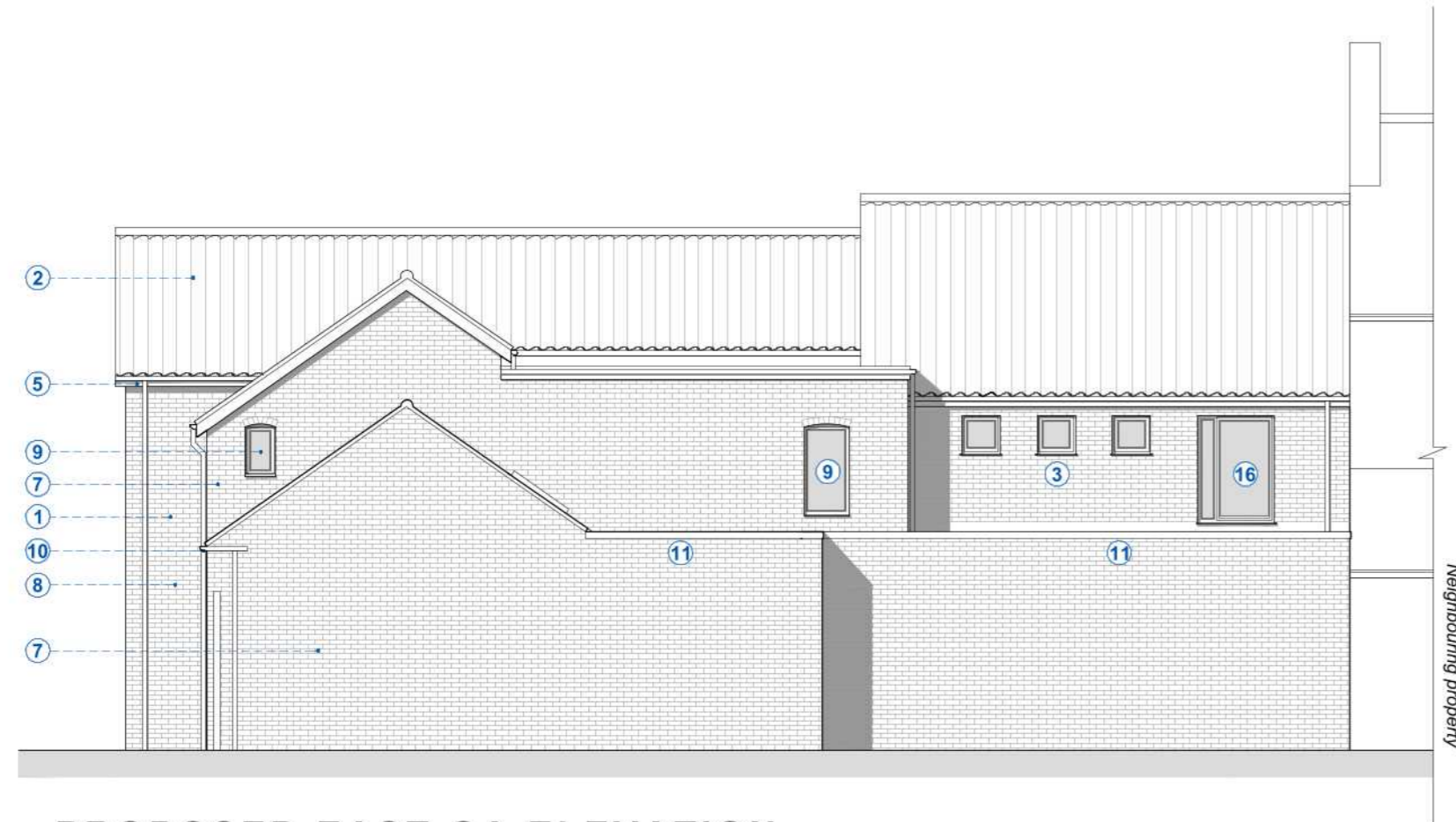
PROPOSED EAST GA ELEVATION 1:100 @ A2