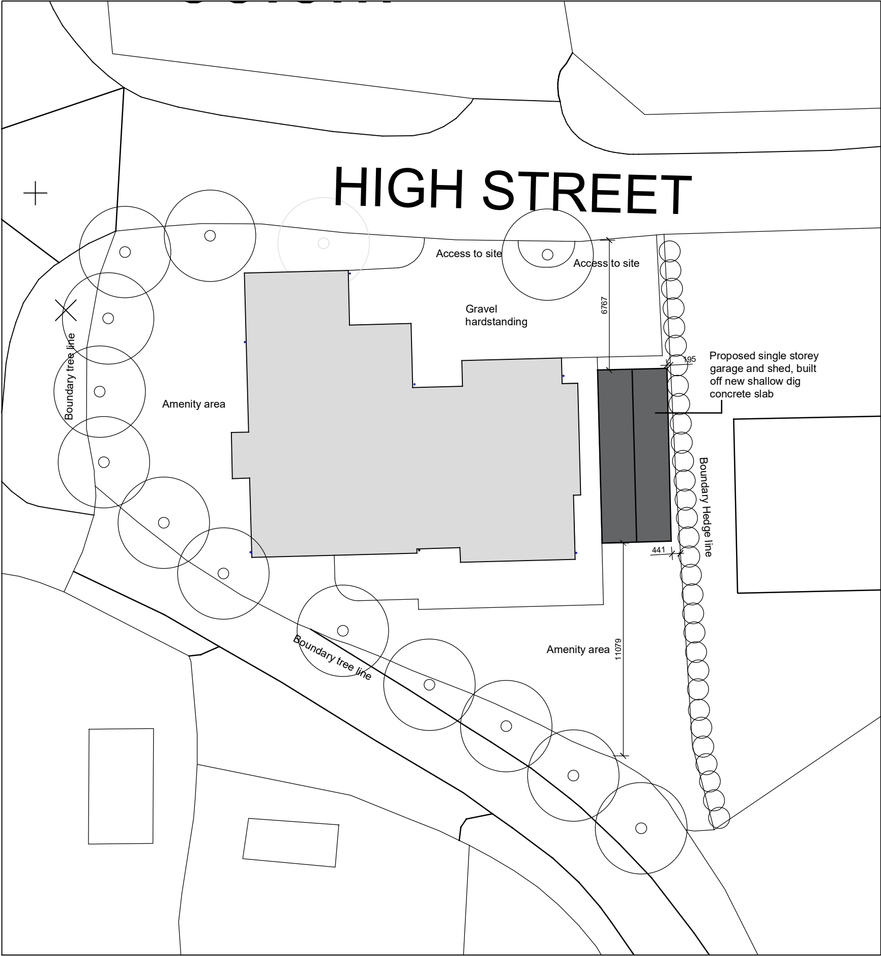
PROPOSED SITE PLAN =- 1:200