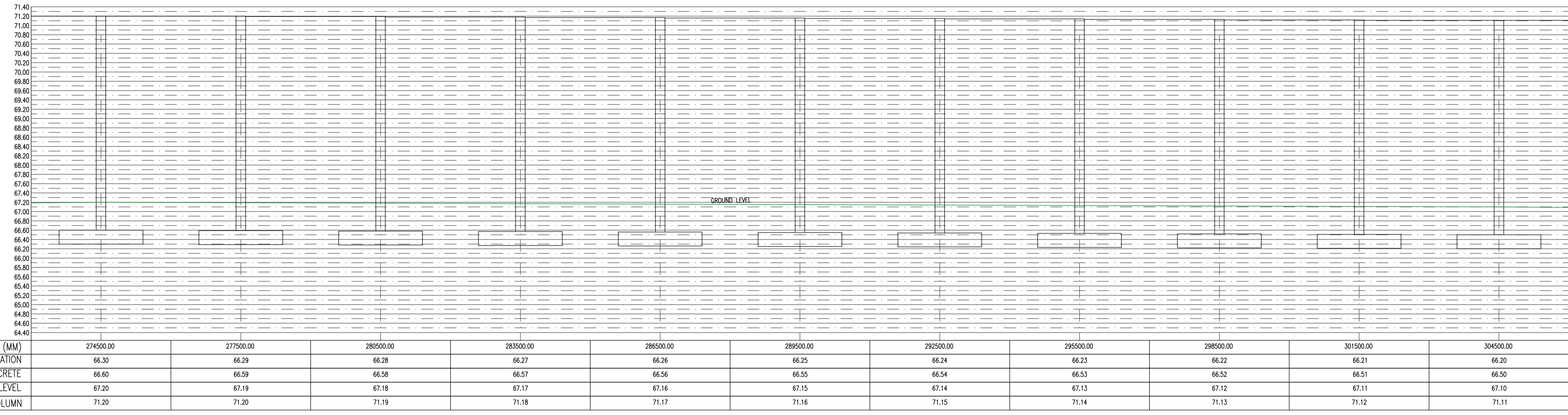
4m HIGH FENCE LONG SECTION (TYPE D) 274.5m-304.5m SCALE 1:50

DO NOT SCALE THIS DRAWING FOR CONSTRUCTION PURPOSES. CONTRACTOR TO CHECK ALL DIMENSIONS AND REPORT ALL ERRORS AND OMISSIONS TO THE ENGINEER.