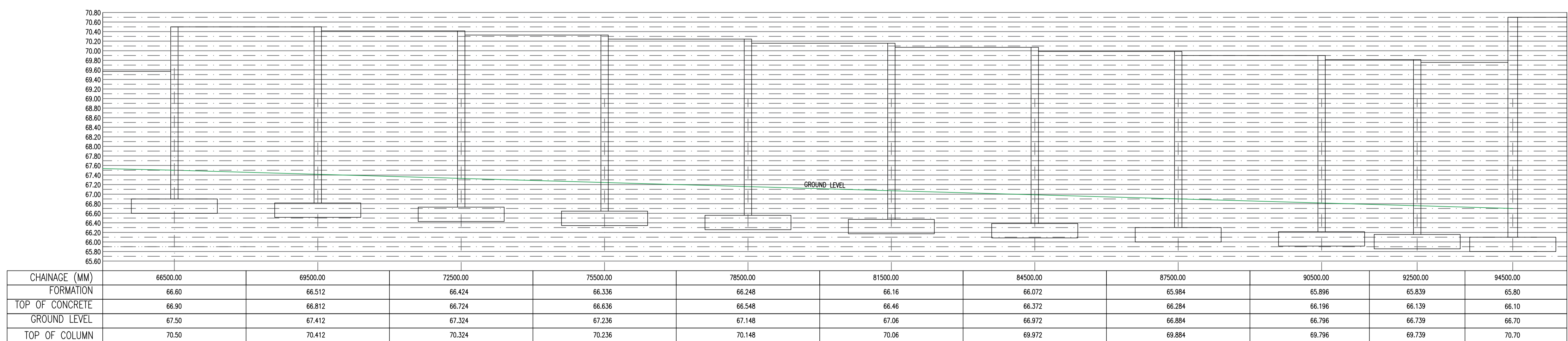
3m HIGH FENCE LONG SECTION (TYPE C) 66.5m-94.5m SCALE 1:50