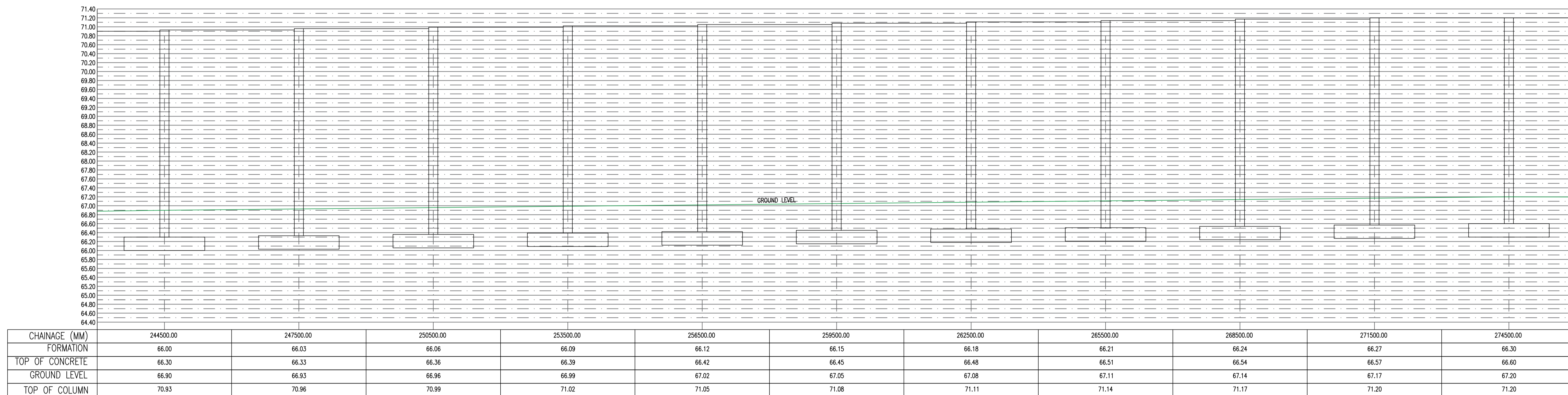
4m HIGH FENCE LONG SECTION (TYPE D) 244.5m–274.5m SCALE 1:50