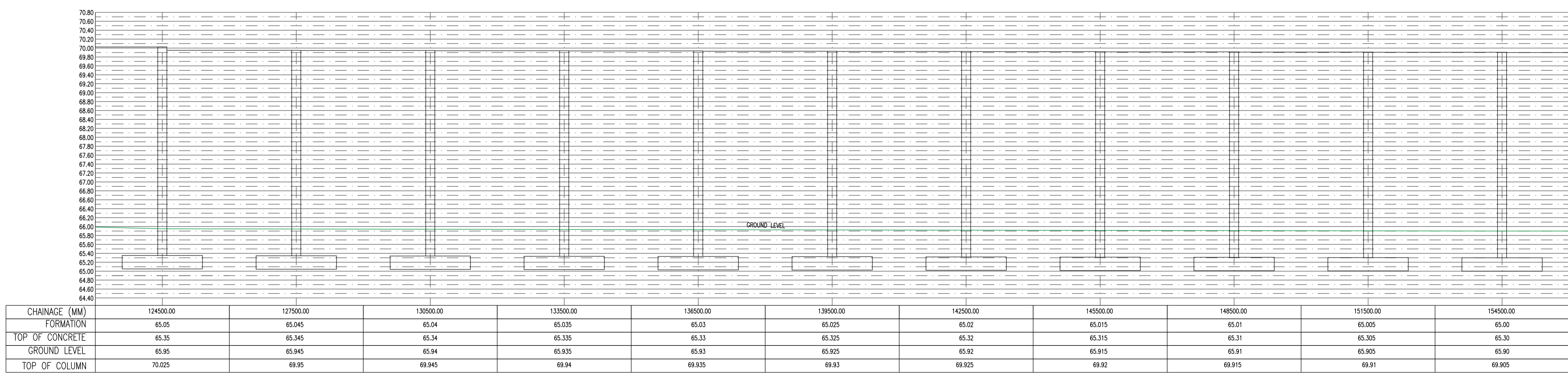
4m HIGH FENCE LONG SECTION (TYPE D) 124.5m-154.5m SCALE 1:50