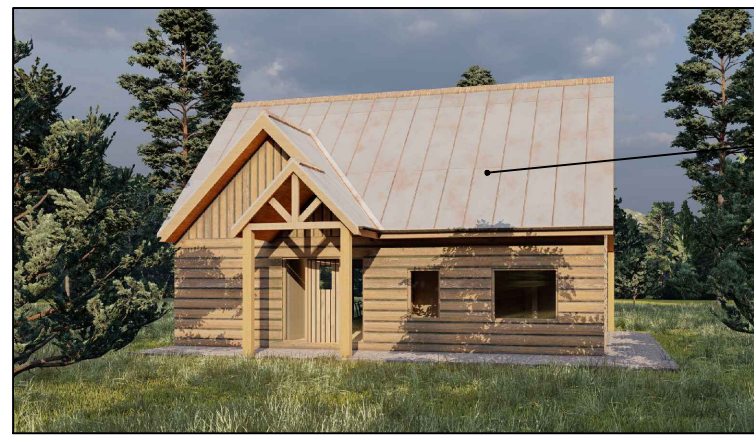
Roof Finish: Standing seam metal roof sheeting