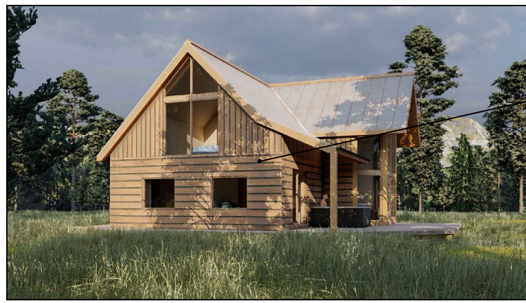
Cladding: Timber board cladding