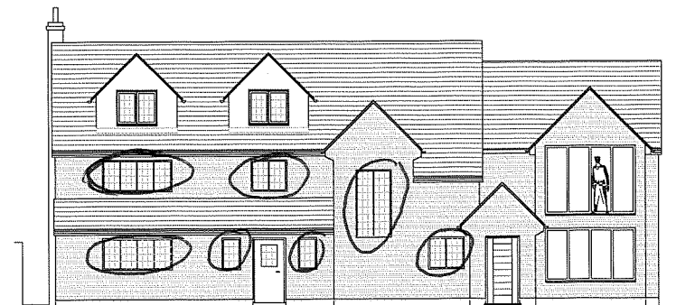
Proposed NE Elevation Scale 1:100 @ A1