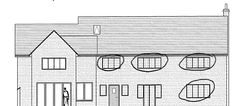
Proposed SW Elevation Scale 1:100 @ A1

DO NOT SCALE UNLESS FOR PLANNING PURPOSES ONLY ALL DIMENSIONS TO BE CHECKED ON SITE FACE