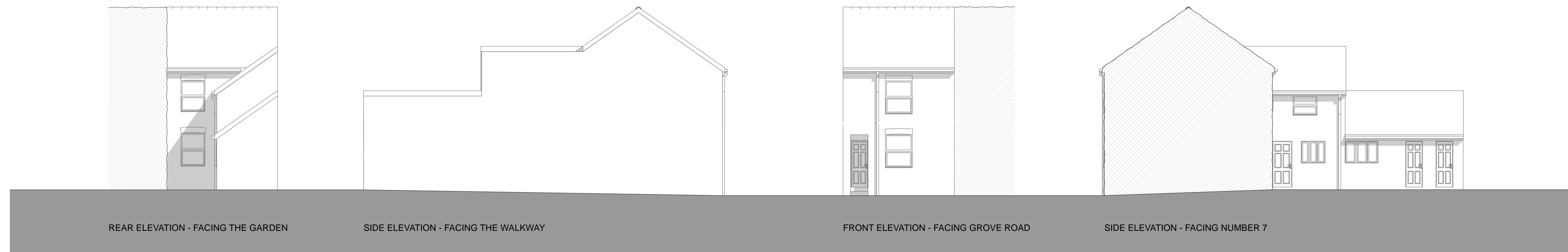
EXISTING ELEVATIONS - SCALE 1:100 @ A1