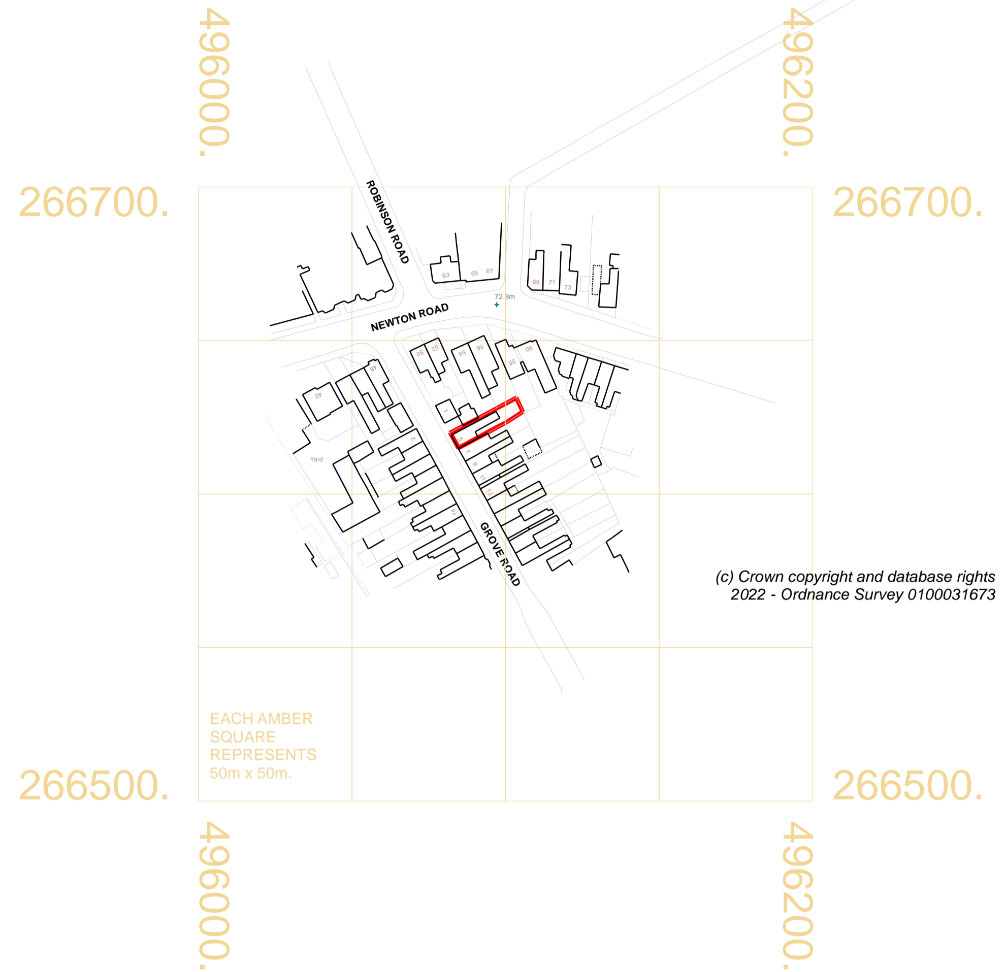
EXISTING LOCATION PLAN - SCALE 1:1250 @ A1