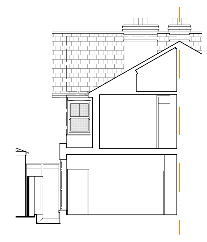
PROPOSED SECTION A-A Scale 1:100