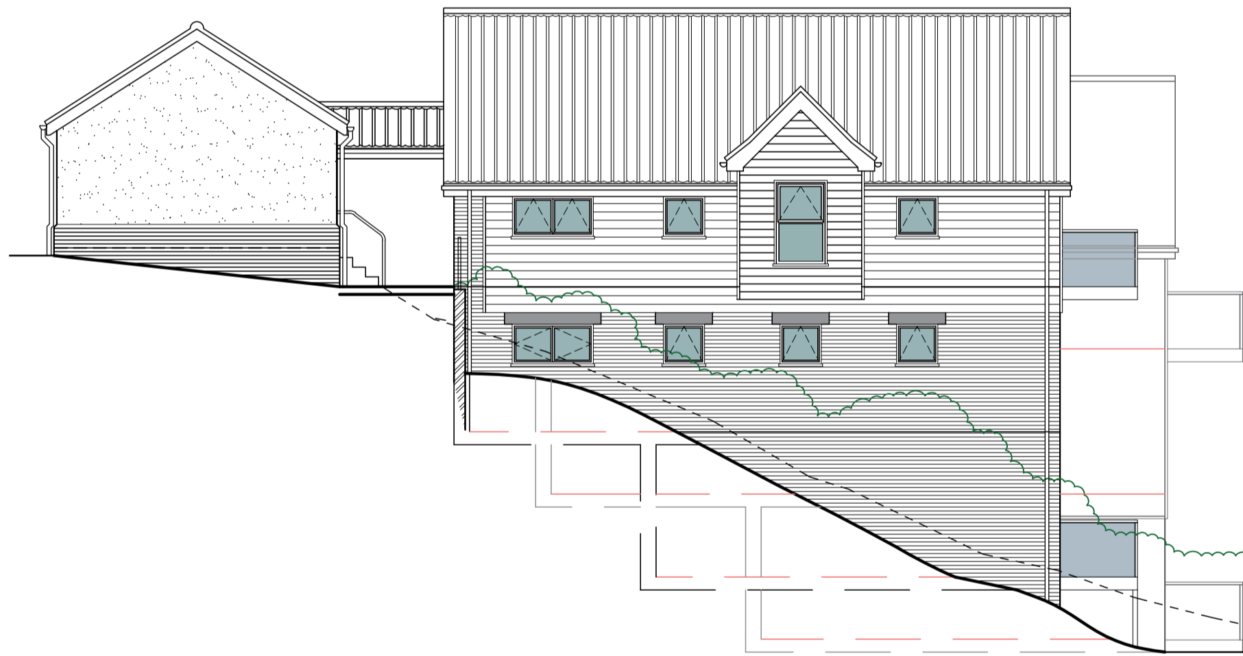
Proposed West Elevation 1:100