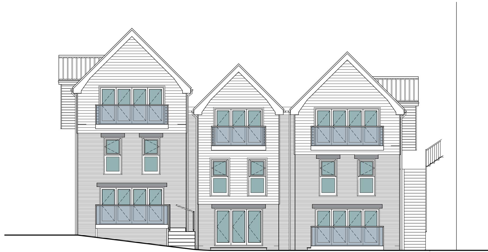
Proposed South Elevation 1:100