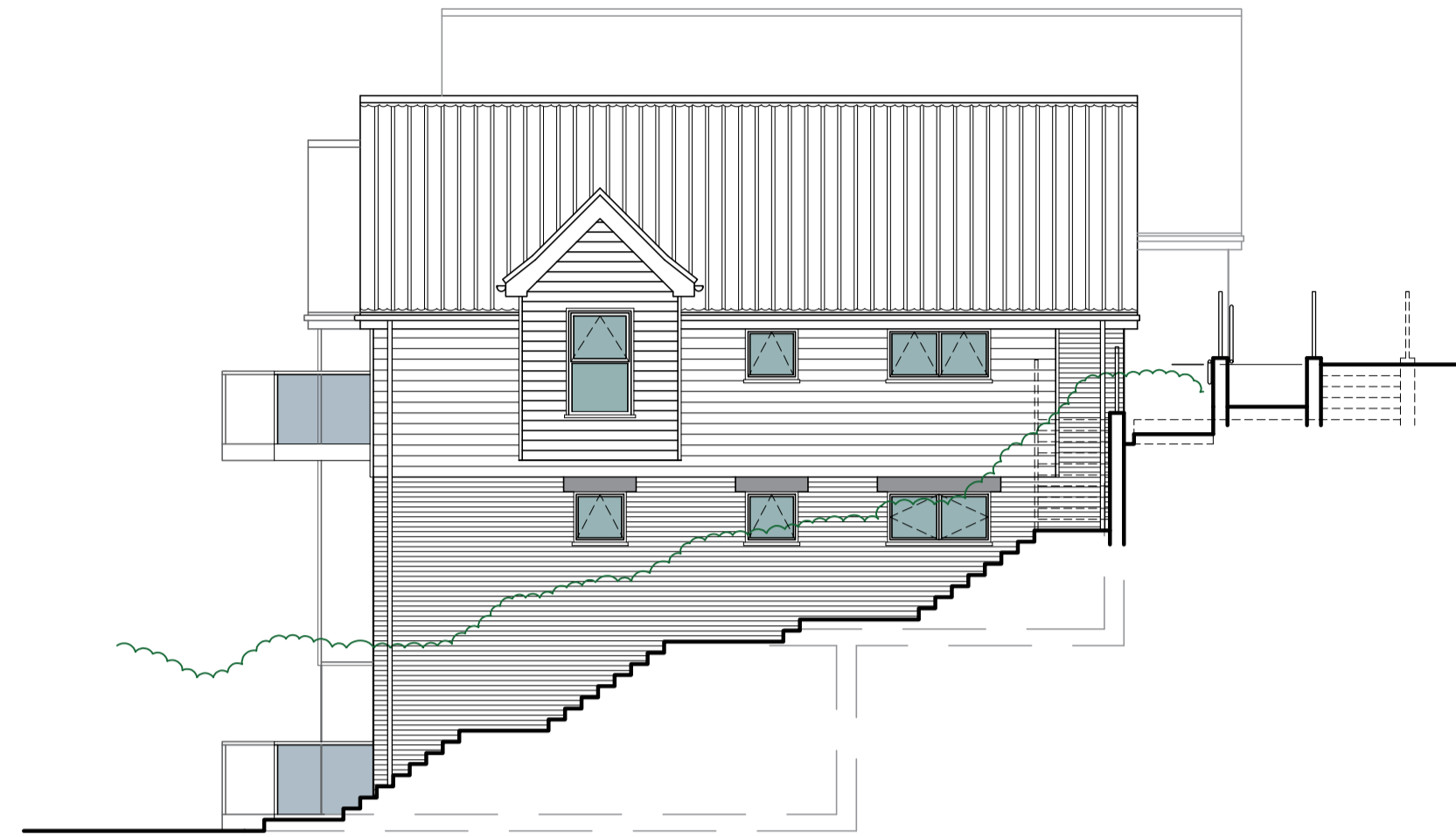
Proposed East Elevation 1:100