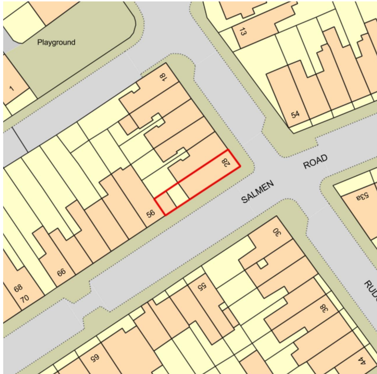
Existing Block Plan (Scale: 1:500)