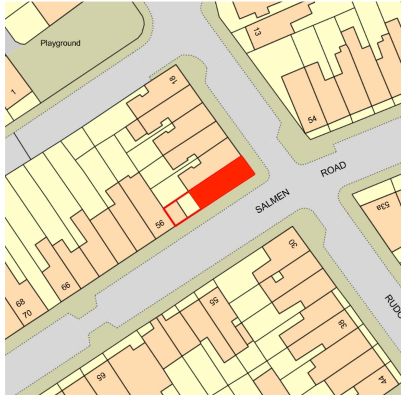
Proposed Block Plan (Scale: 1:500)