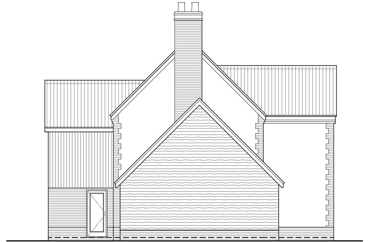
Rear & Side Elevation Option 2