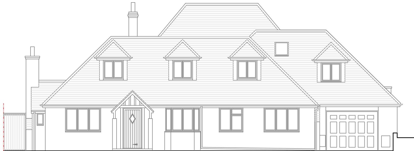
Proposed Front Elevation (West) 1:100