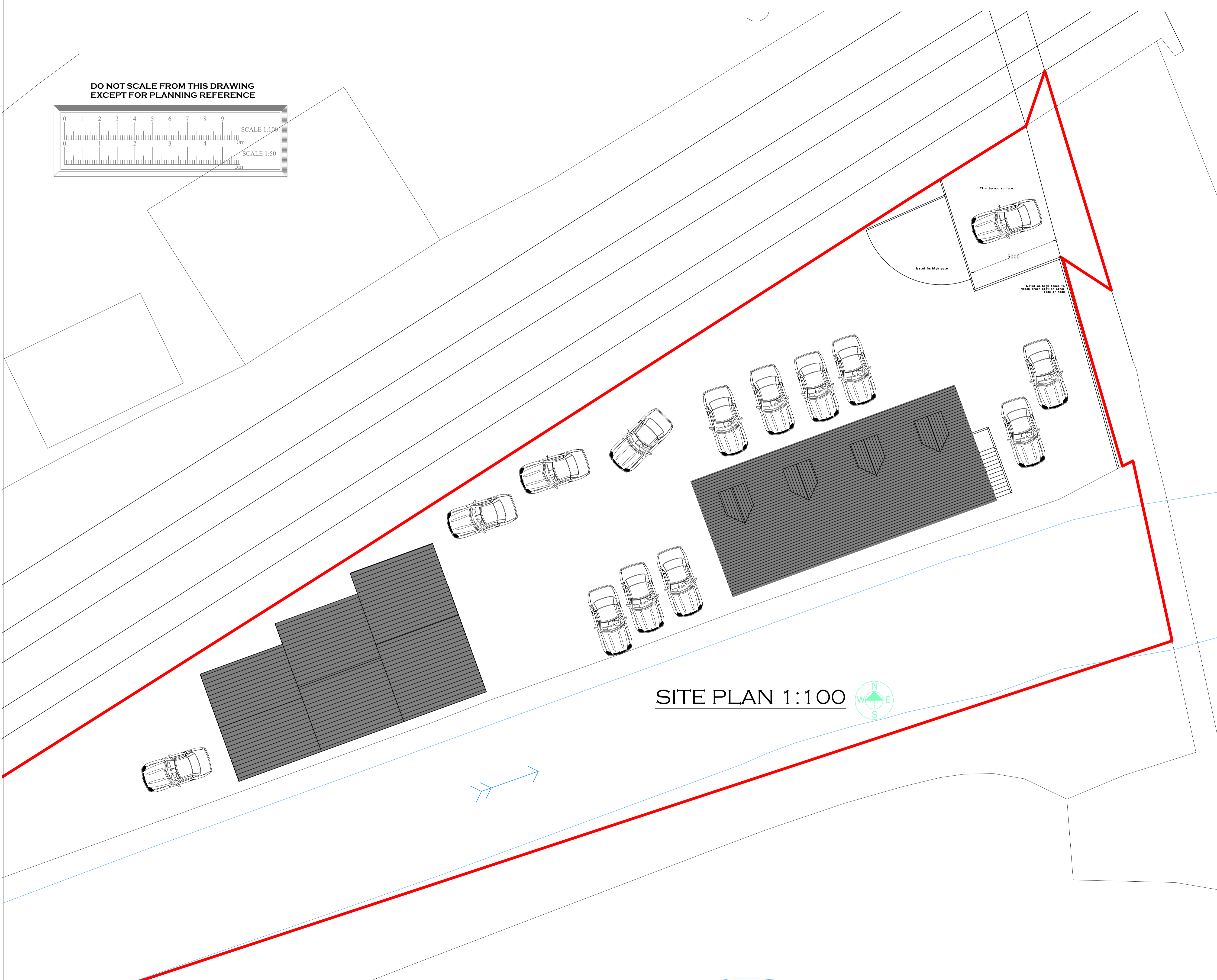
SITE PLAN 1:100