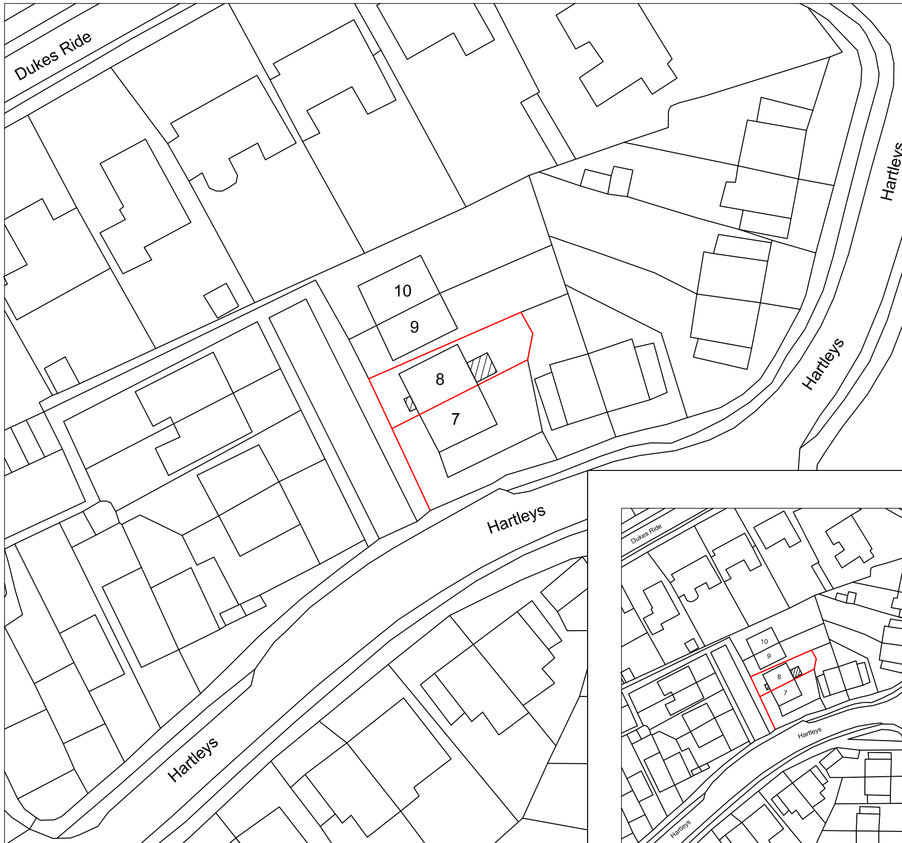
SITE BLOCK PLAN SCALE 1:500