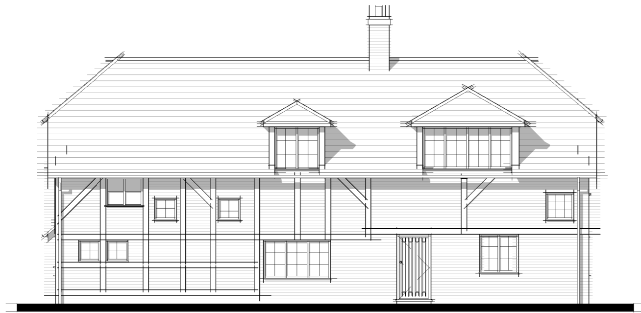
Existing Front 1 : 100