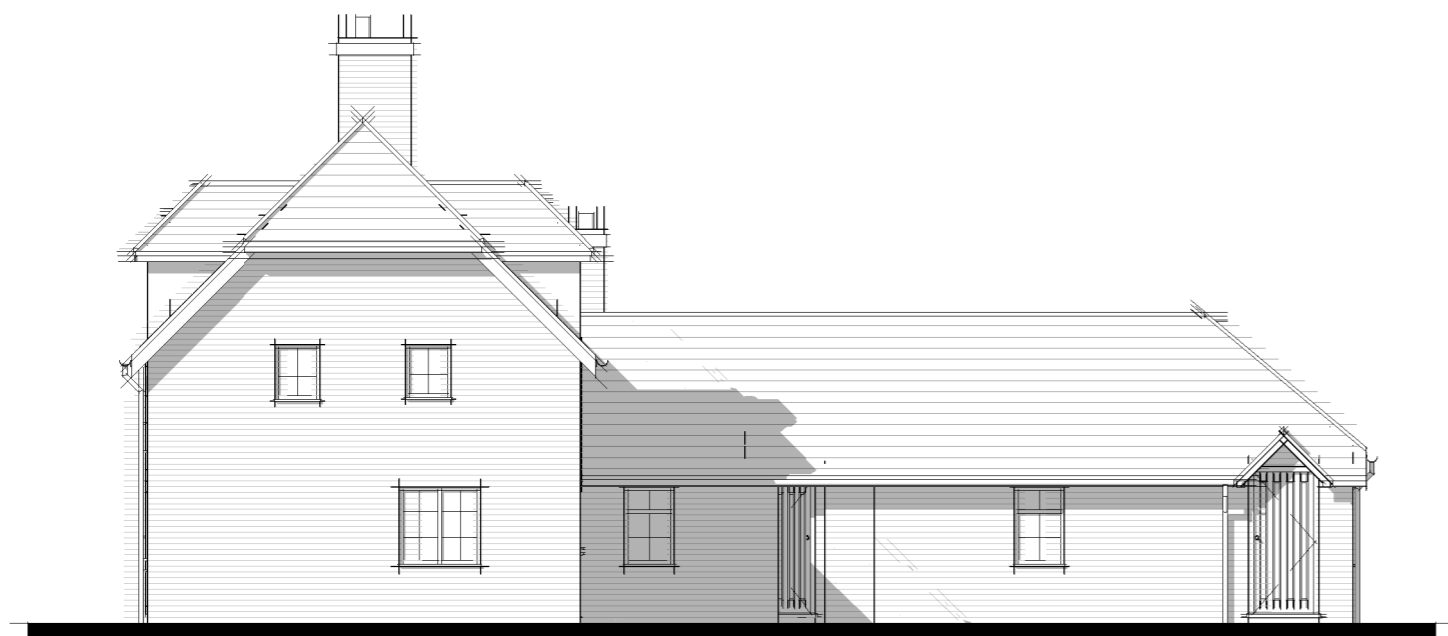
Existing side 1 1 : 100