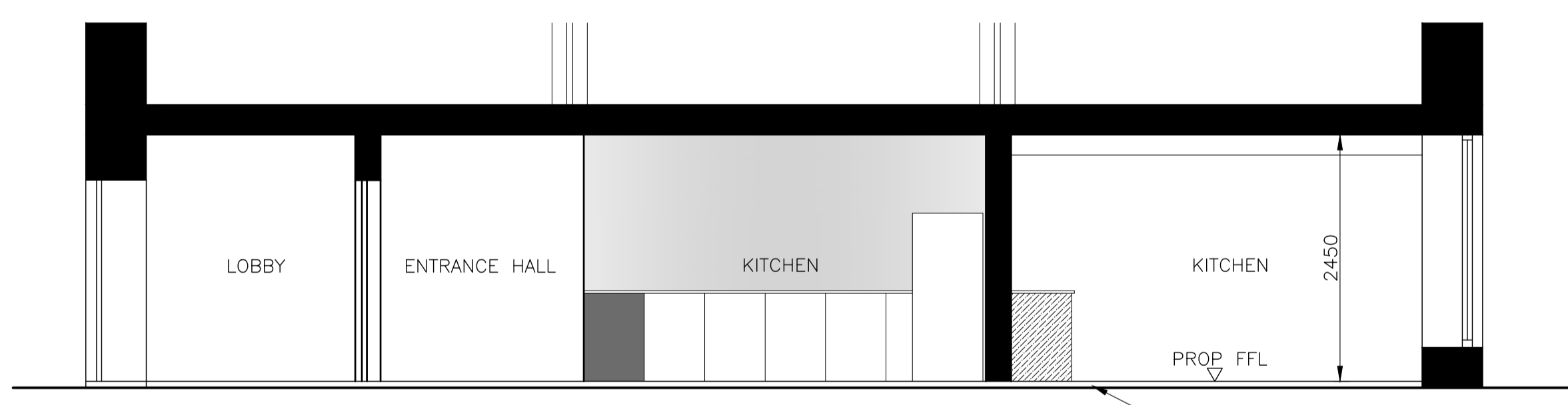
ELEVATION B-B SCALE 1:50

SERVICE VOID TO BE REMOVED AND REPLACE WITH INSULATED FLOATING FLOOR