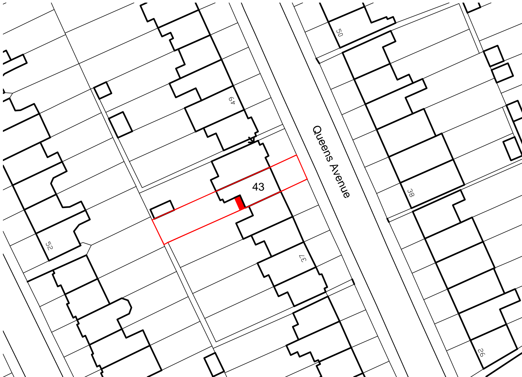
LOCATION PLAN Scale 1:500

DIMENSIONS ARE NOT TO BE SCALED OFF DRAWINGS