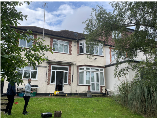
6 Alberon Gardens - Rear facade