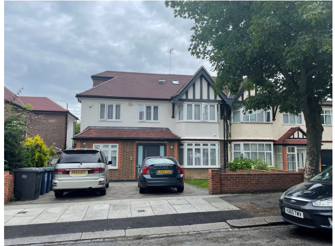
8 Alberon Gardens - Front porch extension and conversion of the garage into an habitable room; roof raised and new dormer.