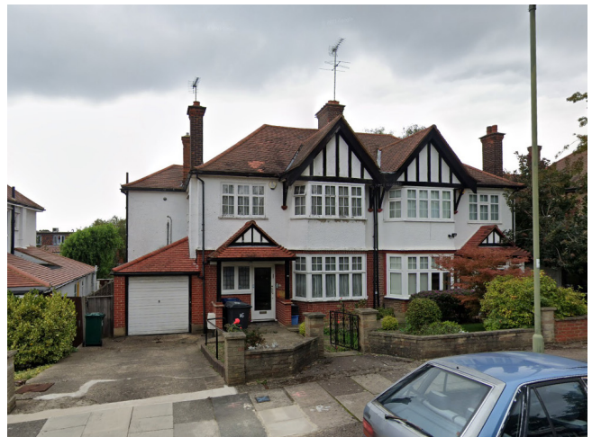
14 and 16 Alberon Gardens