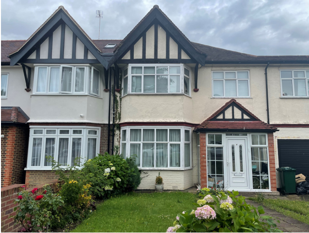
6 Alberon Gardens - Front facade