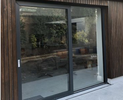
Windows - Dark grey aluminium window frame