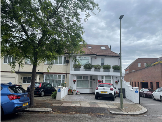
4 and 2 Alberon Gardens - End gable extension