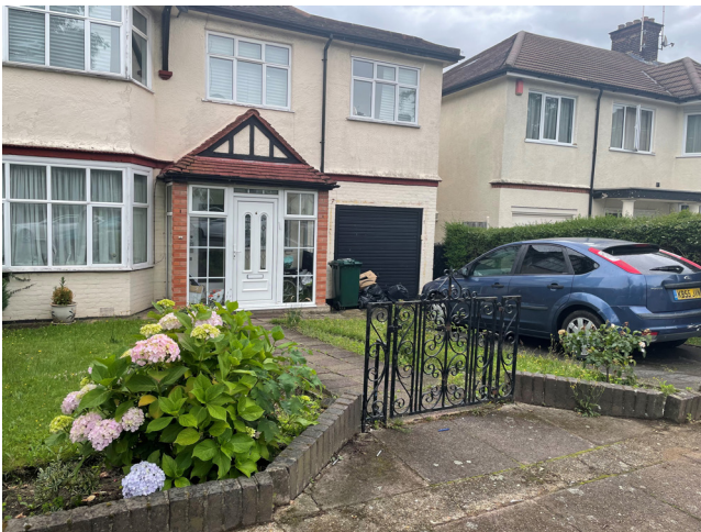
6 Alberon Gardens - Front facade