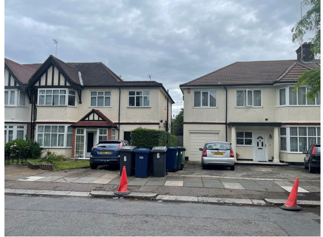
6 Alberon Gardens - Front facade