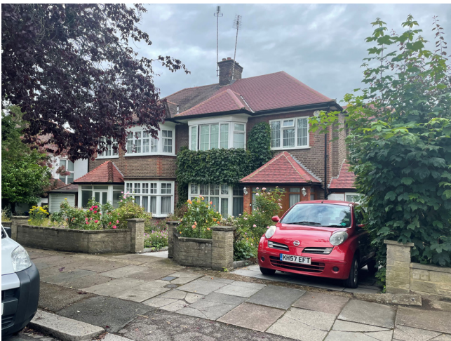
10 Alberon Gardens