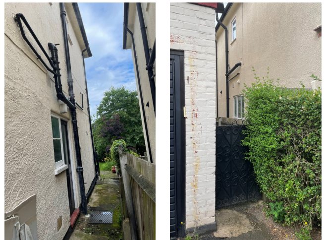
6 Alberon Gardens - side facade