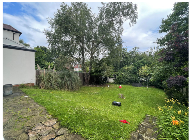
6 Alberon Gardens -Rear garden