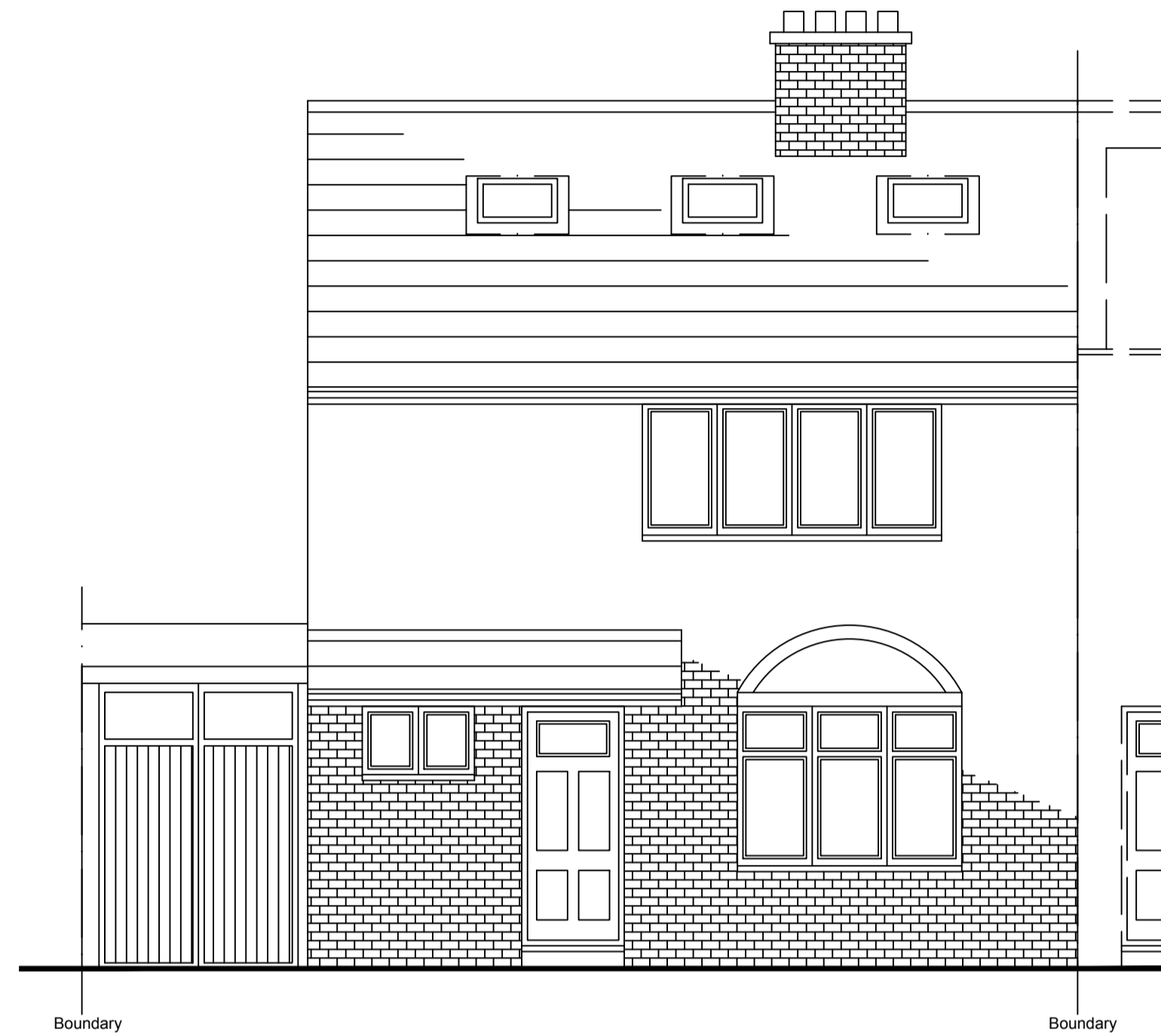
PROPOSED FRONT ELEVATION (scale 1:50)