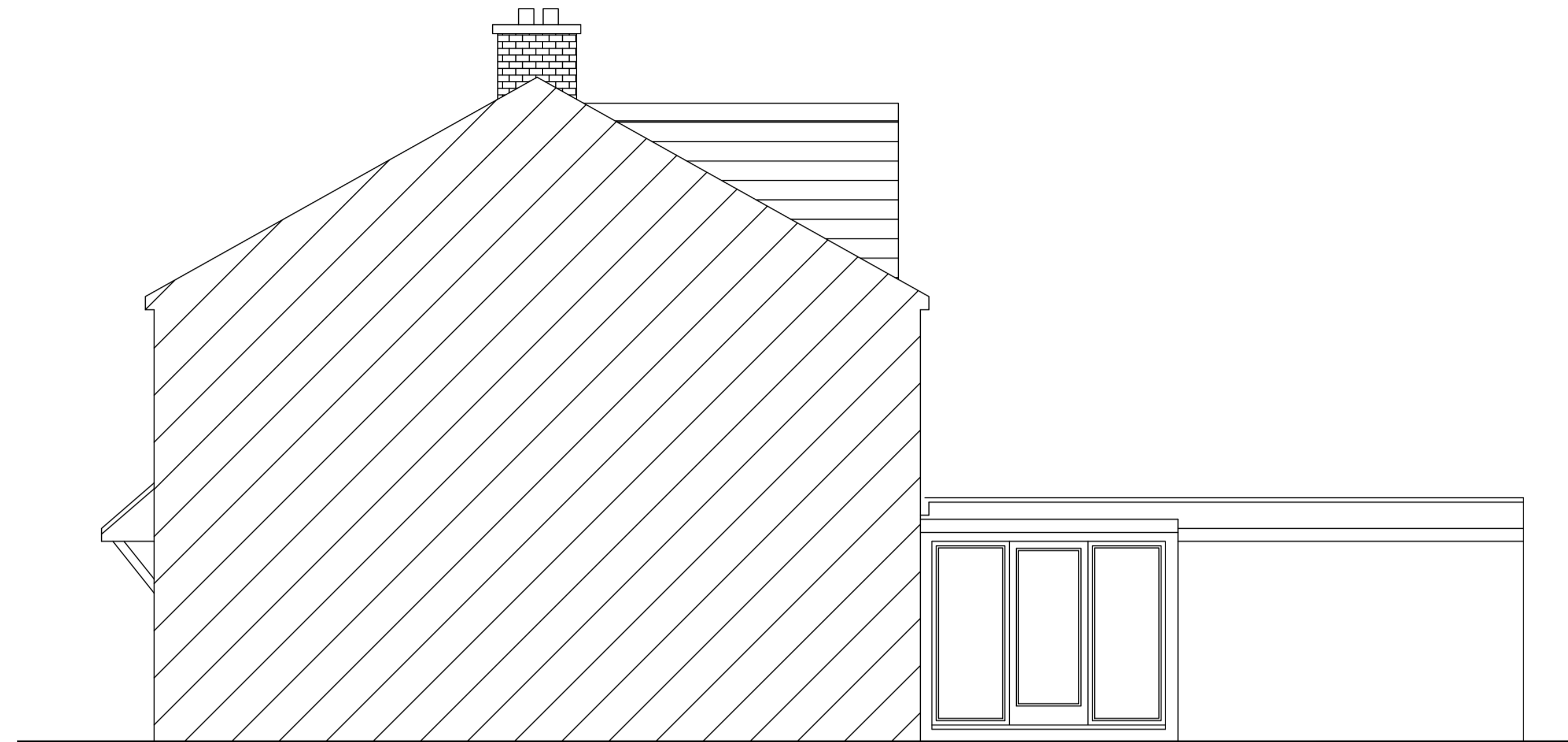
PROPOSED ADJ. SIDE ELEVATION (scale 1:50)