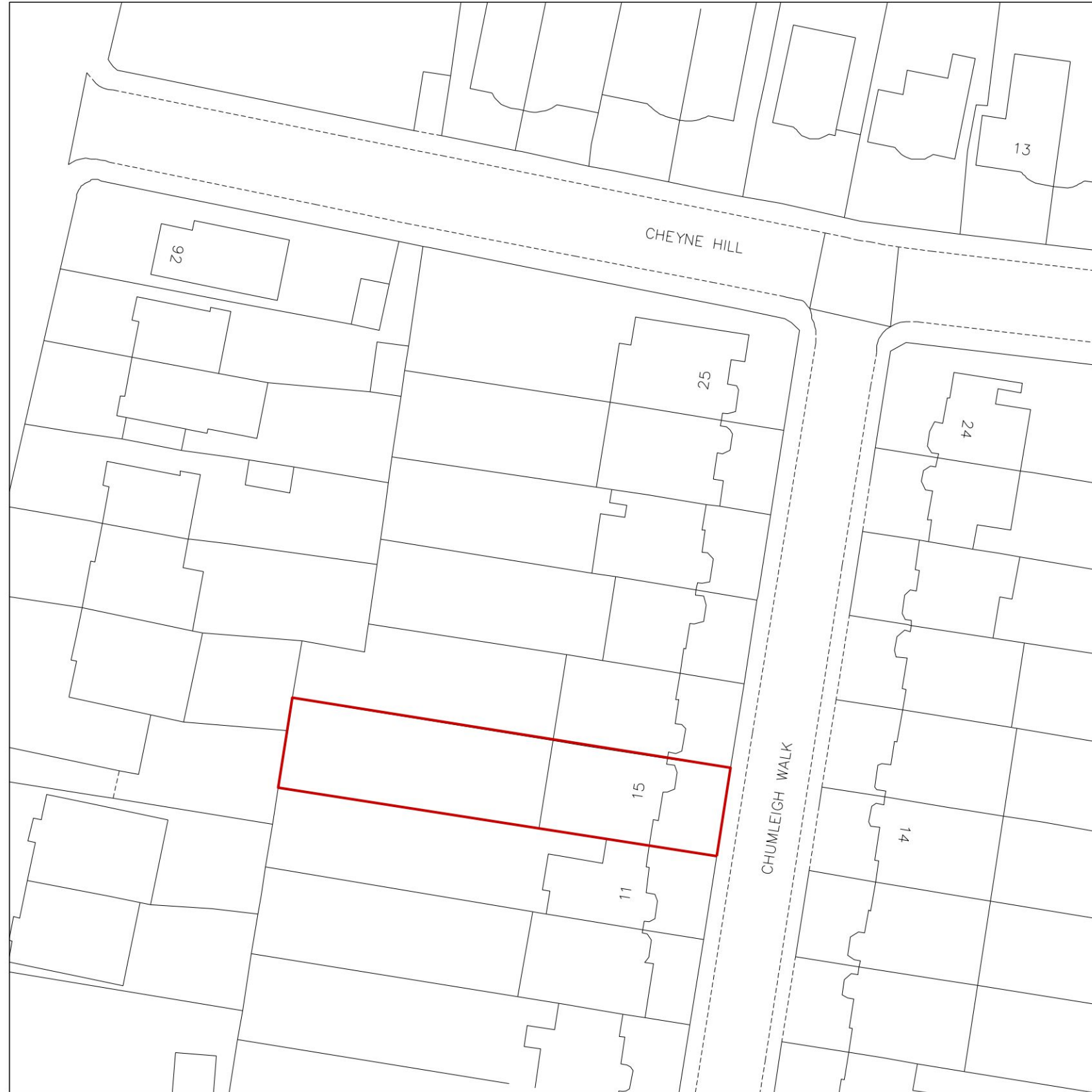
EXISTING BLOCK PLAN Escale 1:500 @ A3

LOCATION 15 Chumleigh Walk, Kingston - KT5 8BW