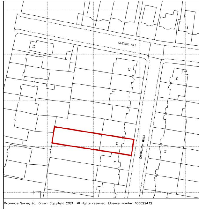
SITE PLAN Escale 1:1250 @ A3