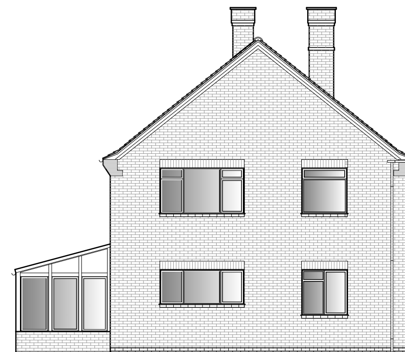
EXISTING SIDE SOUTH WEST ELEVATION