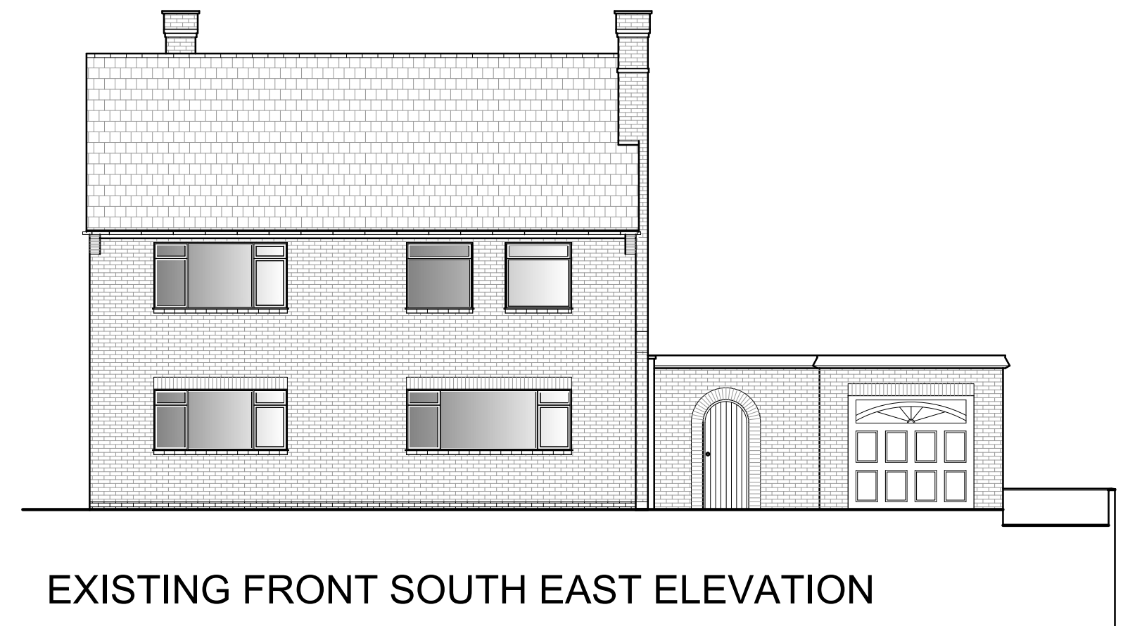
EXISTING FRONT SOUTH EAST ELEVATION