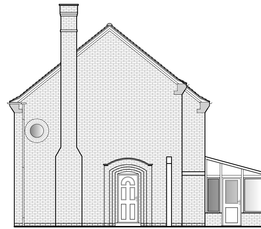
EXISTING SIDE NORTH EAST ELEVATION