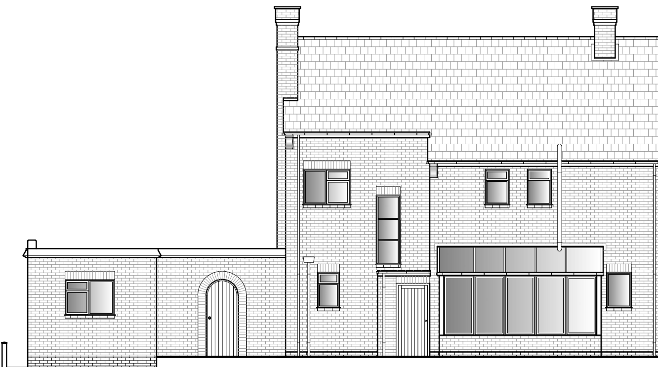
EXISTING REAR NORTH WEST ELEVATION