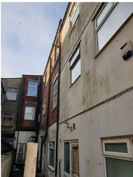
Courtyard side view of 118 Promenade