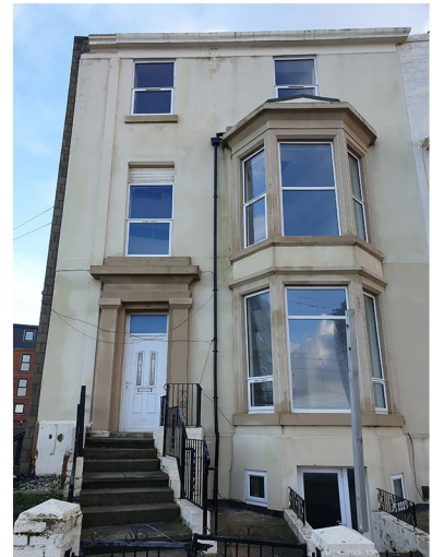
Front view of 118 Promenade