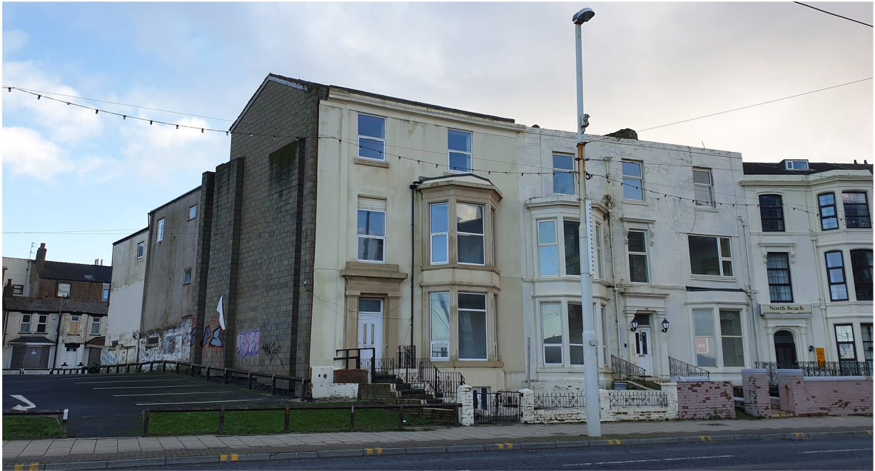
Front and side view of 118 Promenade from the Promenade