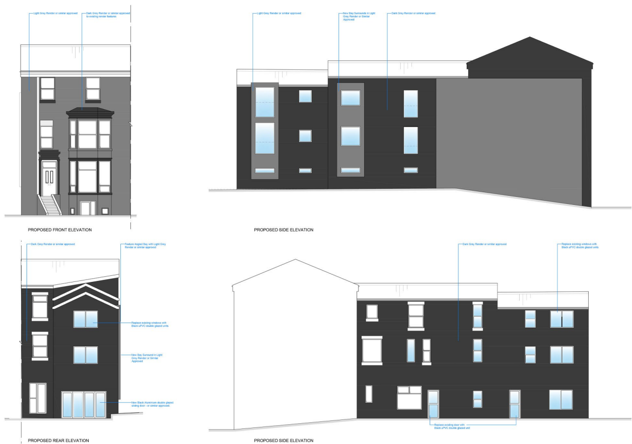
Fig. 1 - ABOVE: Proposed Elevations

The front and rear will be up updated and refreshed with new railings to the front.