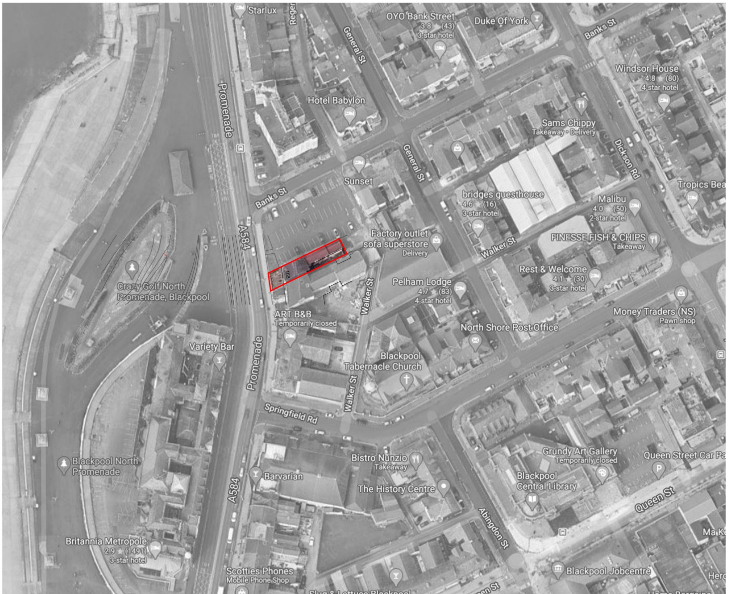
Fig. 1 - Site Aerial View

The existing site consists of a derelict multi apartment scheme building. This site can be accessed straight off the Promenade to the front or Filey Place to rear.