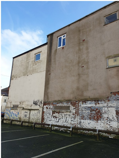
Side view of 118 Promenade