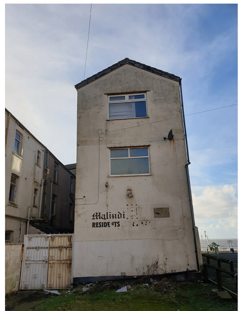
Rear view of 118 Promenade