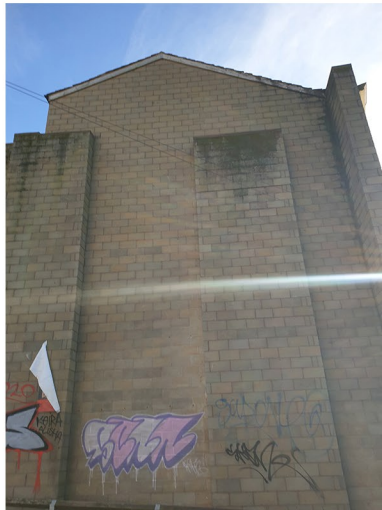
Side view of 118 Promenade