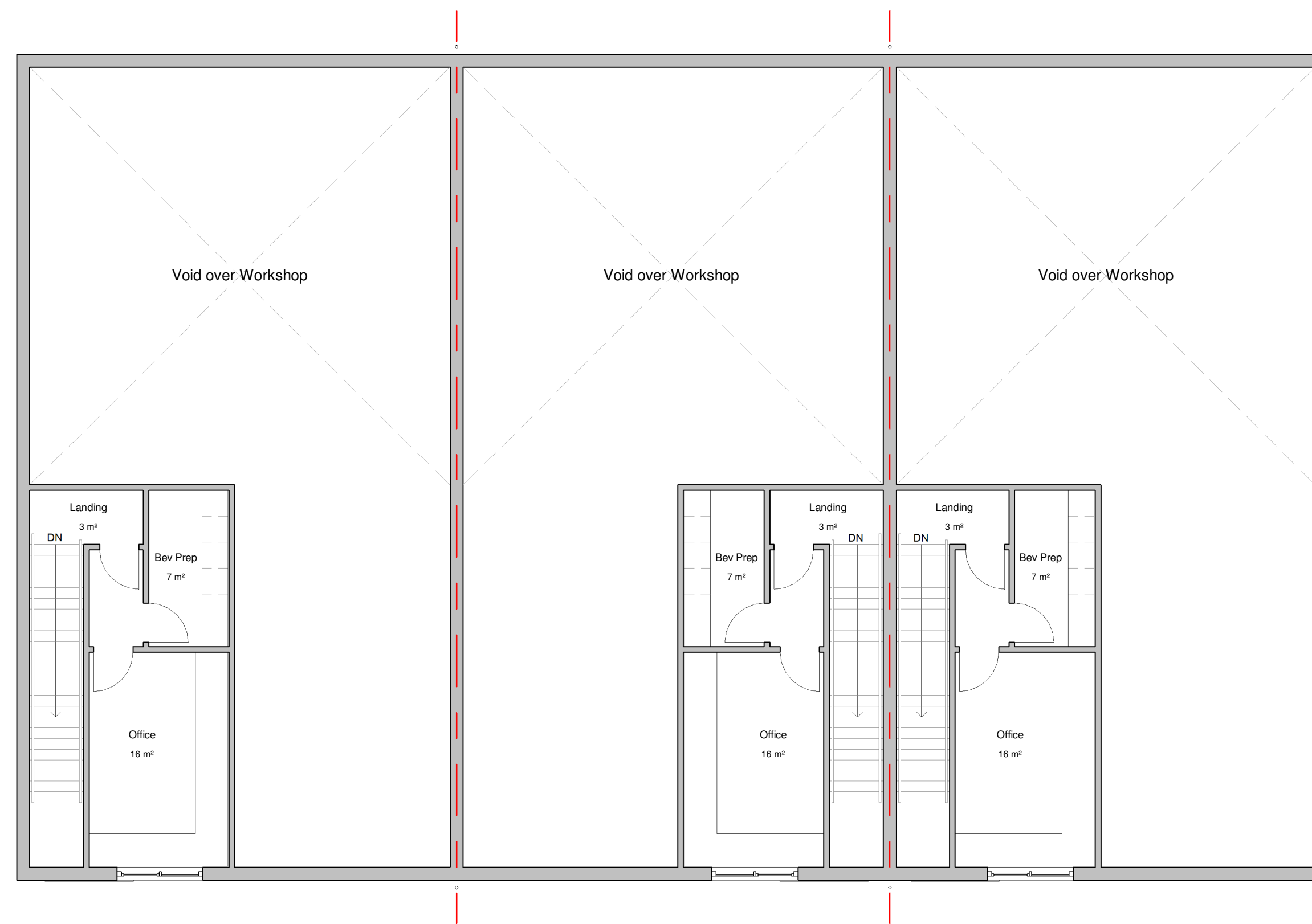
First Floor Plan 1 : 100