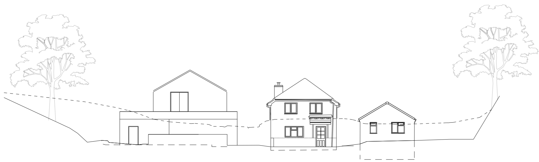
01 East Elevation 1:100