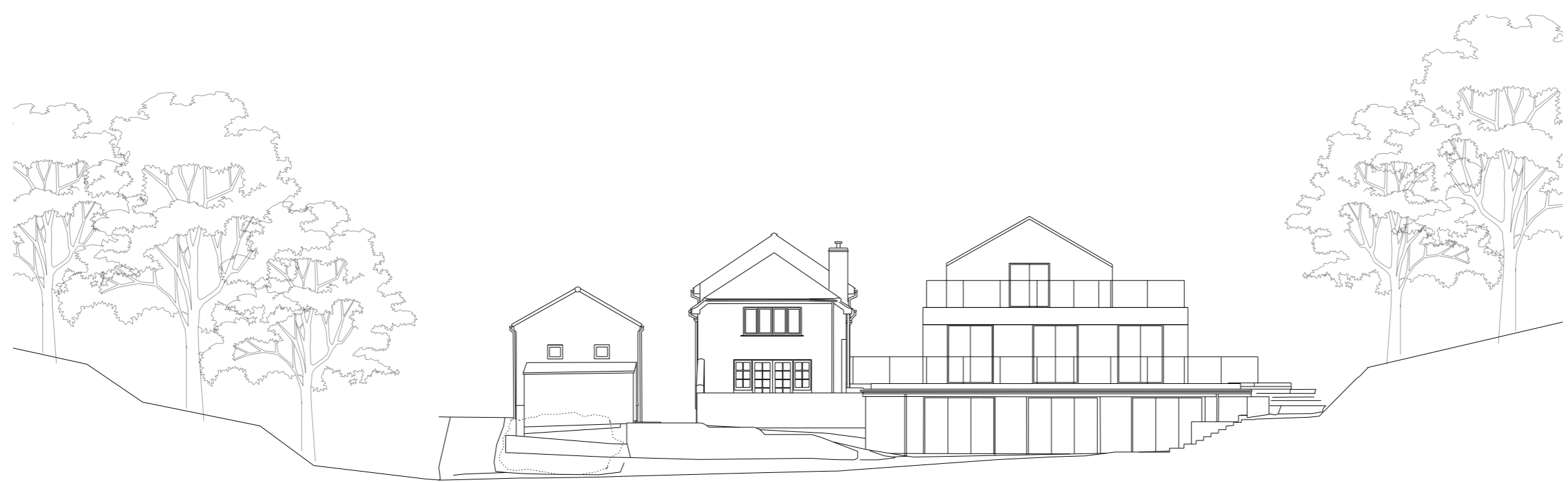
02 West Elevation 1:100