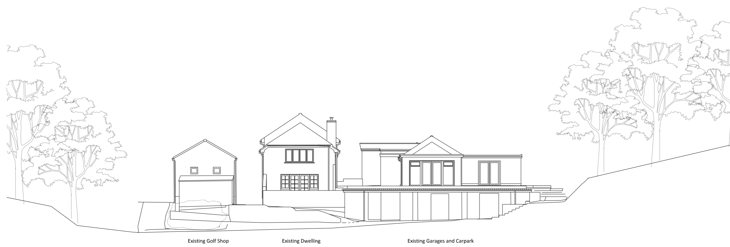
02 Existing West Elevation 1:100