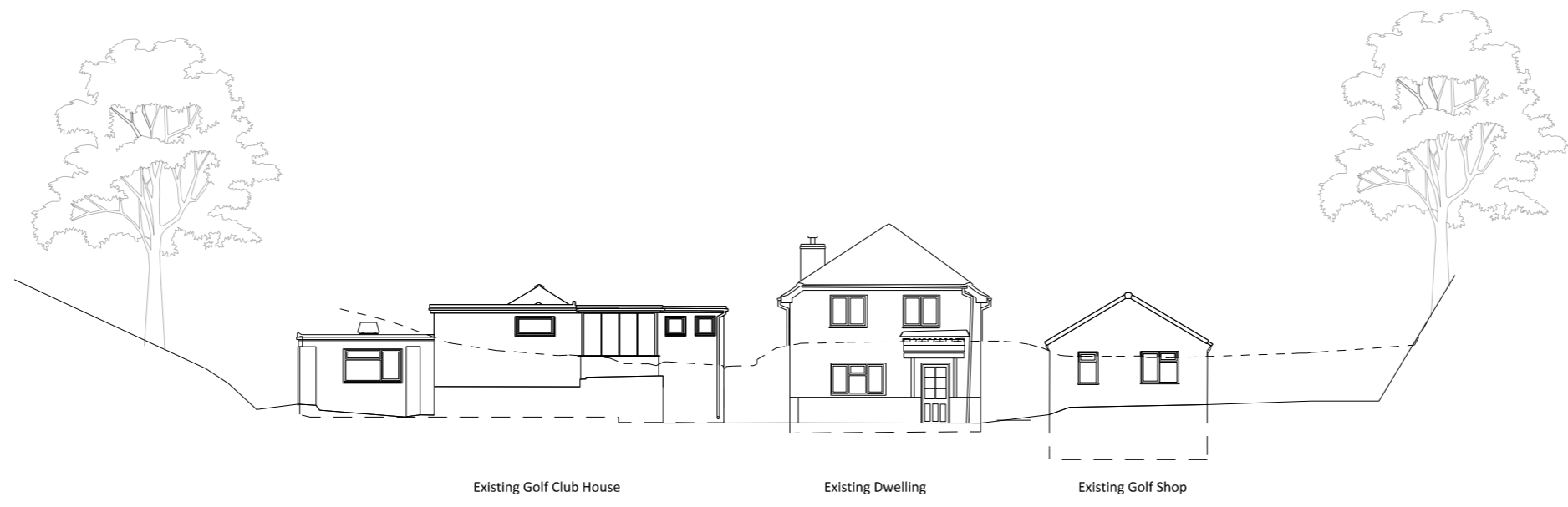
01 Existing East Elevation 1:100