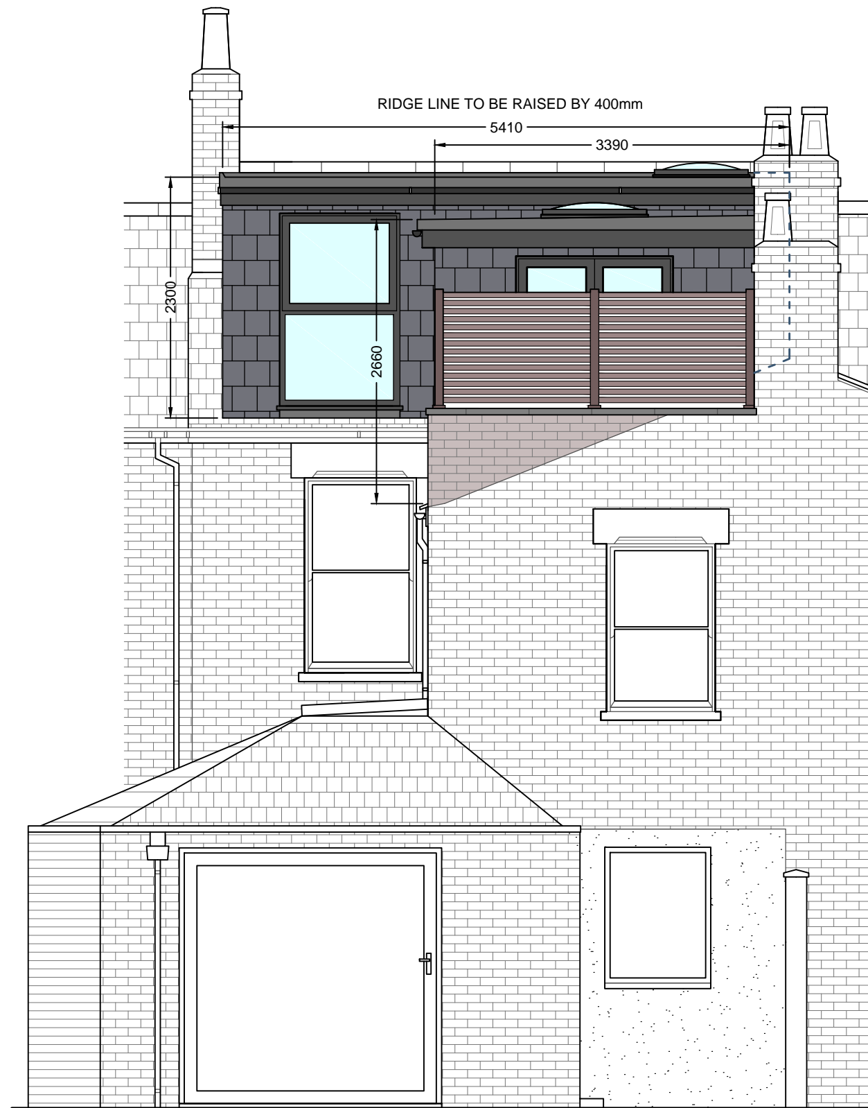
E PROPOSED REAR ELEVATION 06 SCALE 1/50