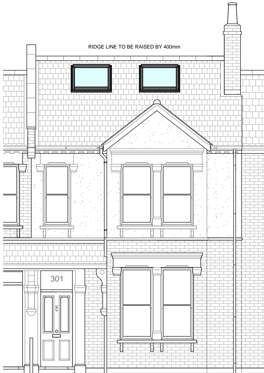
E PROPOSED FRONT ELEVATION 05 SCALE 1/50