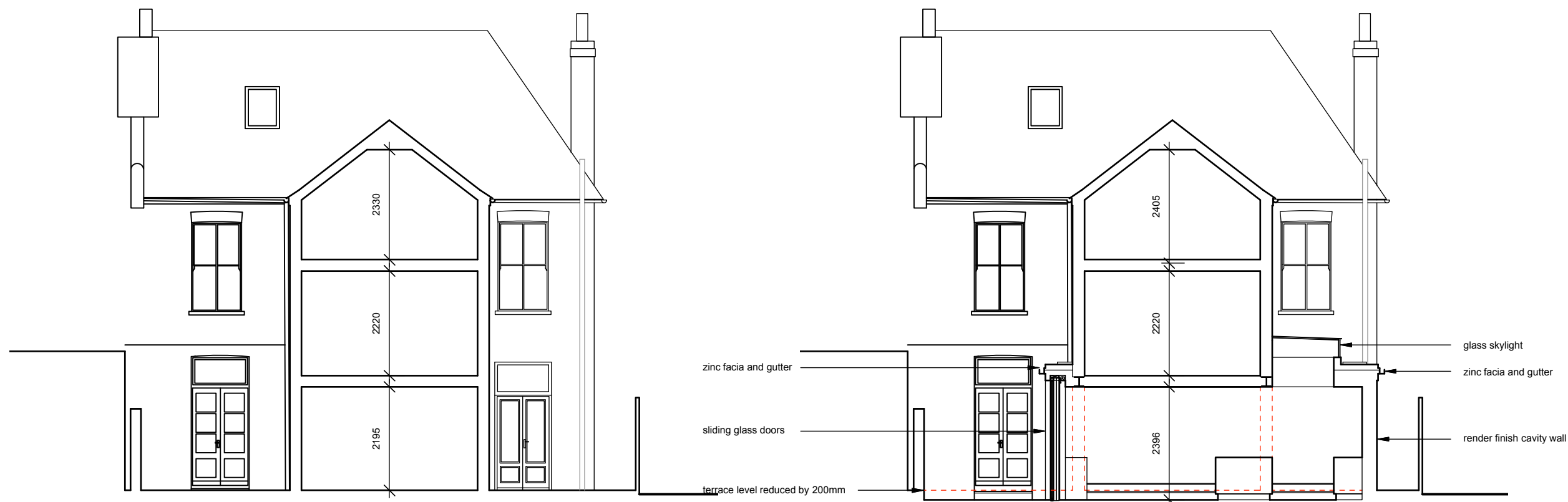
SECTION B - B - existing