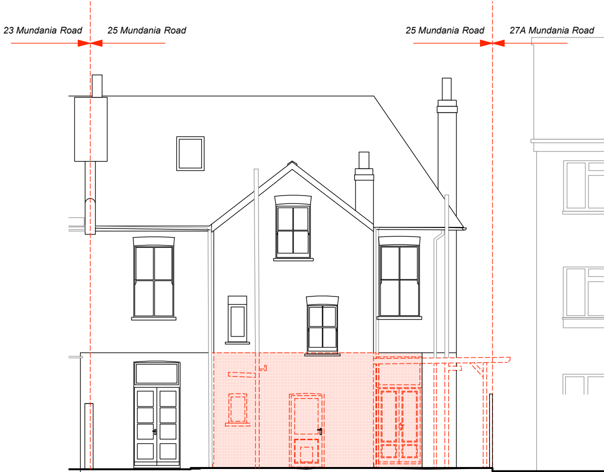
EXISTING SOUTH (REAR) ELEVATION