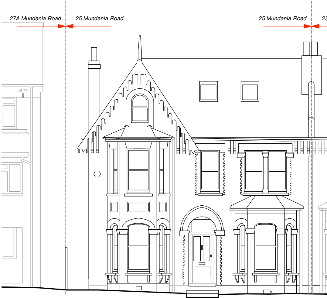
EXISTING NORTH (FRONT) ELEVATION