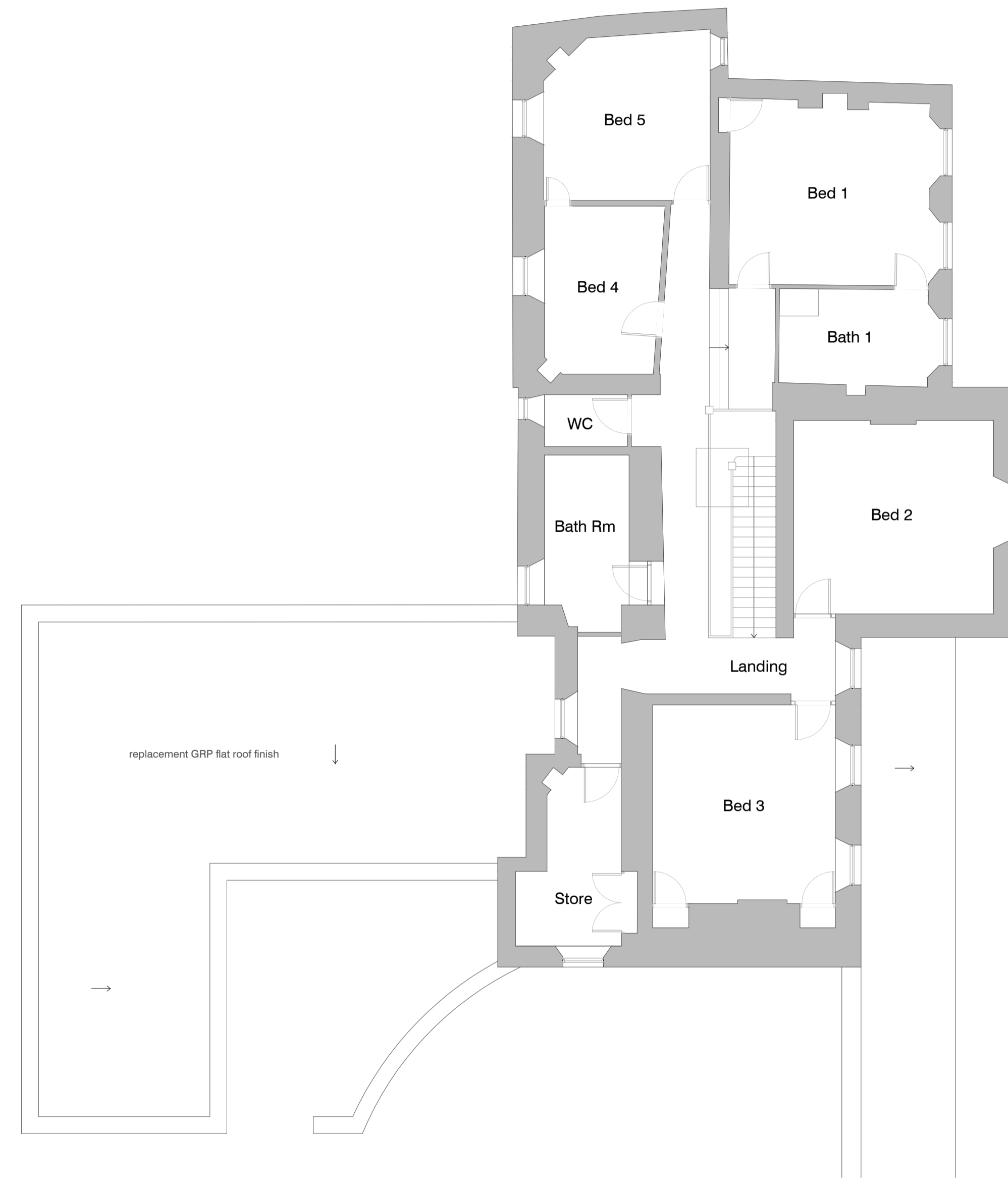
Proposed First Floor Plan