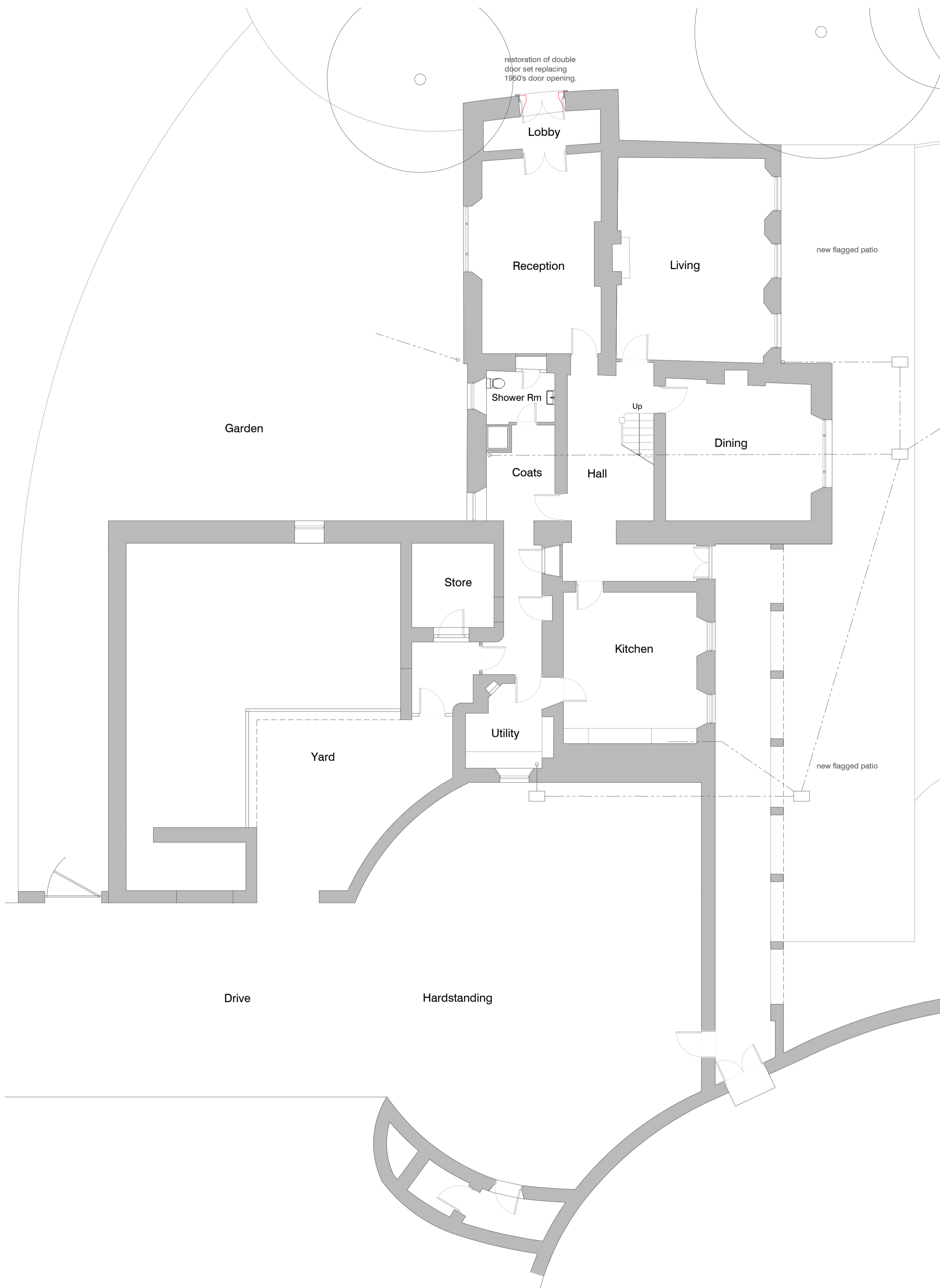
Proposed Ground Floor Plan

This drawing is copyright and is not to be reproduced. The contractor will be held responsible for the accuracy of works involving the setting out and checking of all dimensions on the drawing and on site. Dimensions must not be scaled from this drawing.