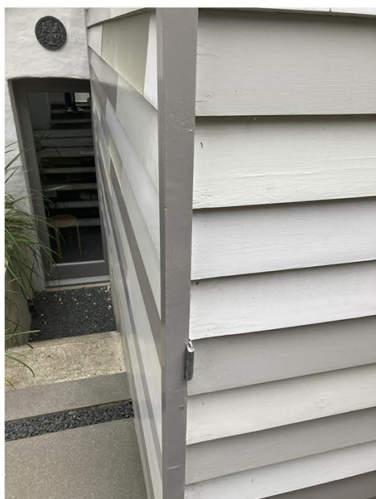
Image 5 - existing rear extension detail