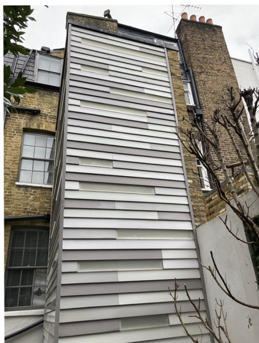
Image 1 - existing rear extension

The heritage aspect of the property does not change.