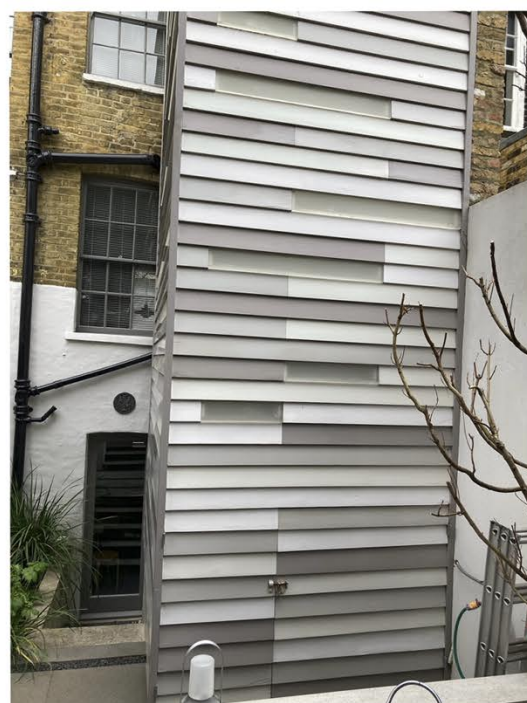
Image 5 - existing rear extension detail