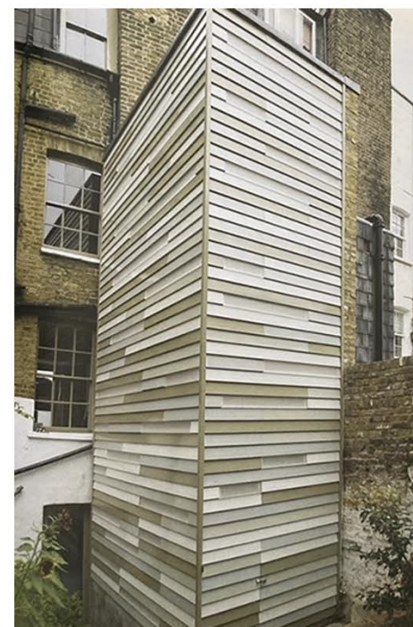
Image 3 - existing rear extension