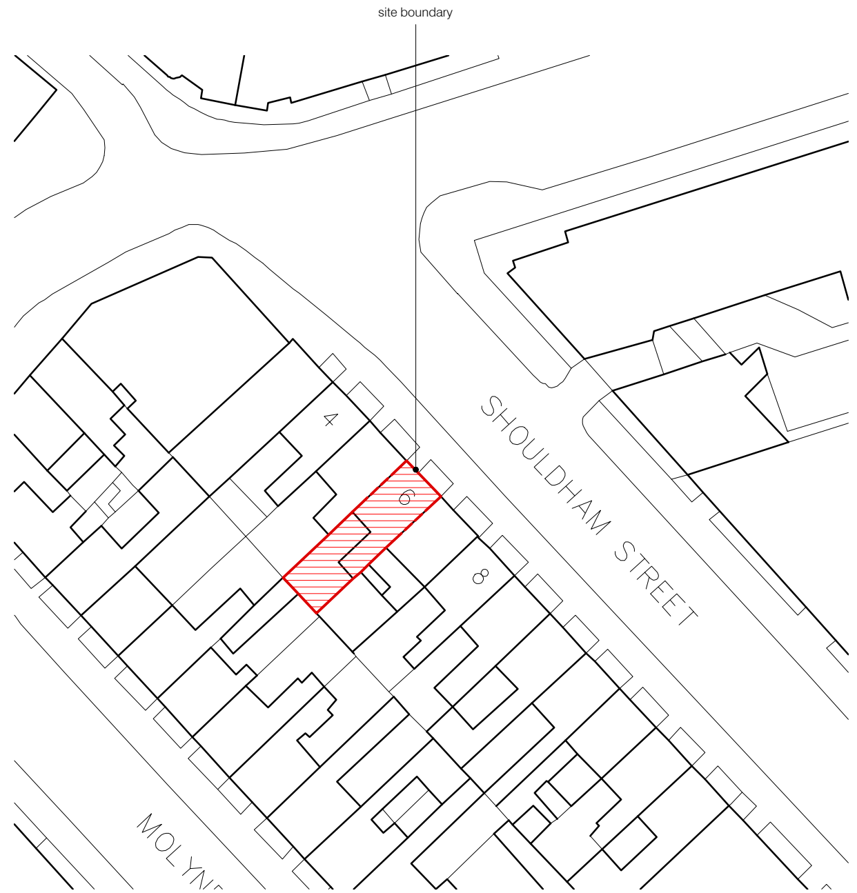
02 SITE PLAN scale 1:500