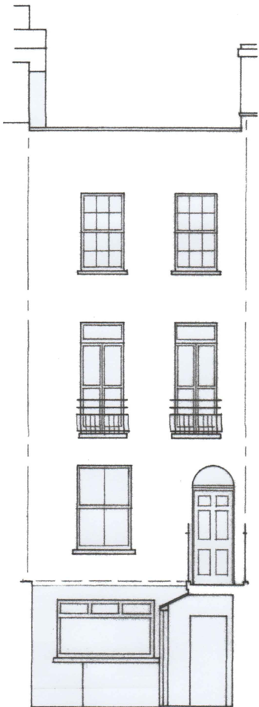
01 EXISTING FRONT ELEVATION scale 1:50