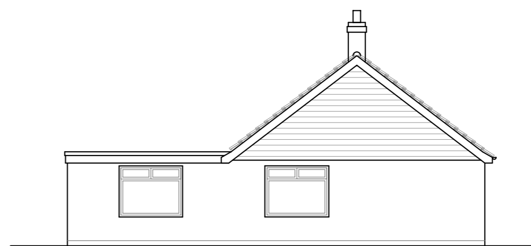
SIDE ELEVATION - WEST Scale 1:100