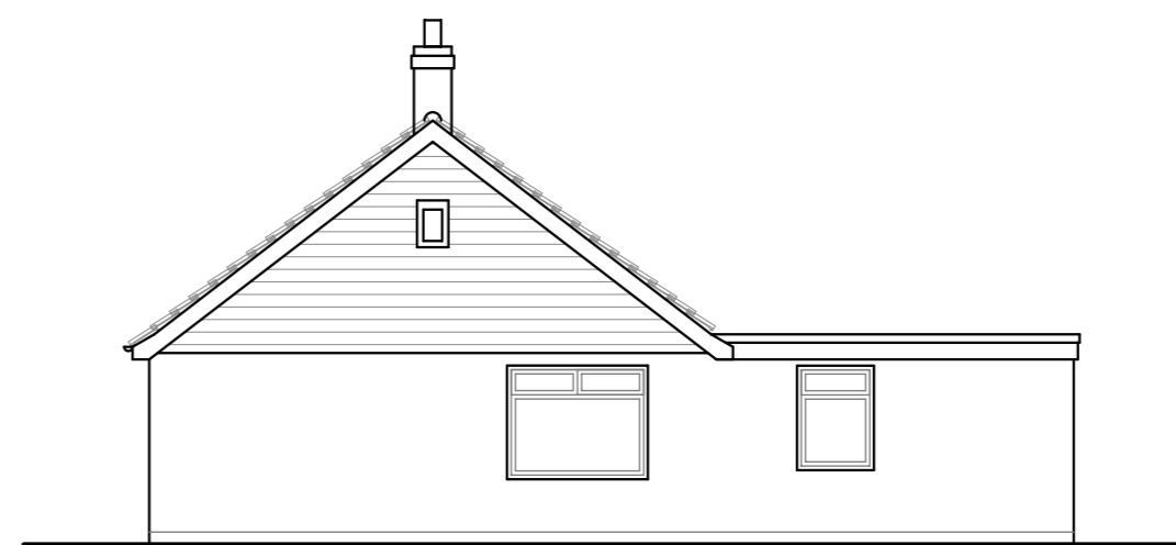
SIDE ELEVATION - EAST Scale 1:100