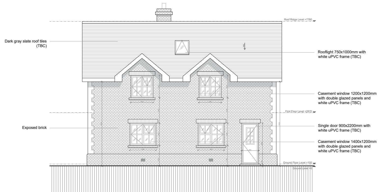
Proposed North Elevation