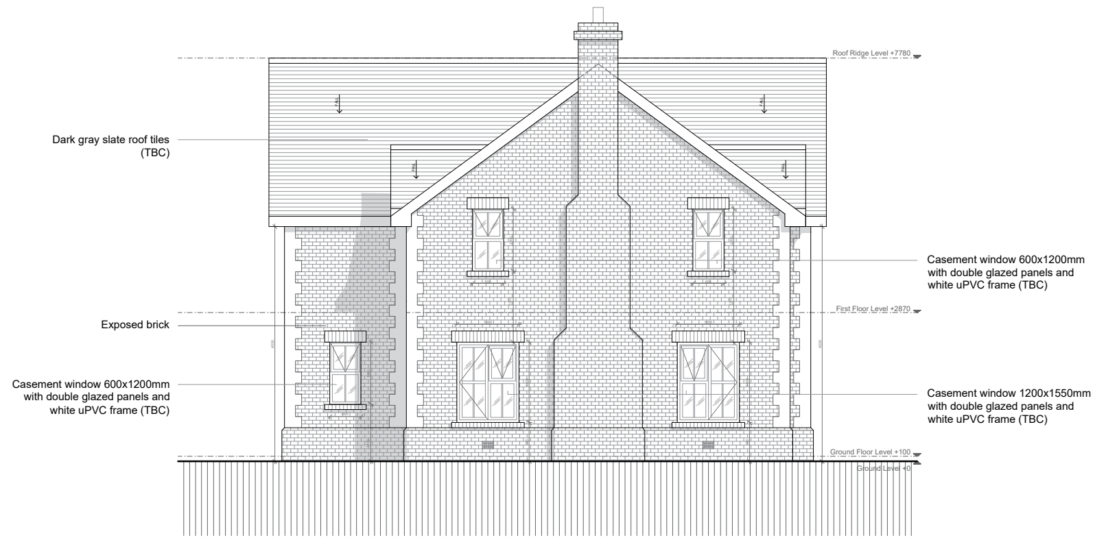
Proposed South Elevation