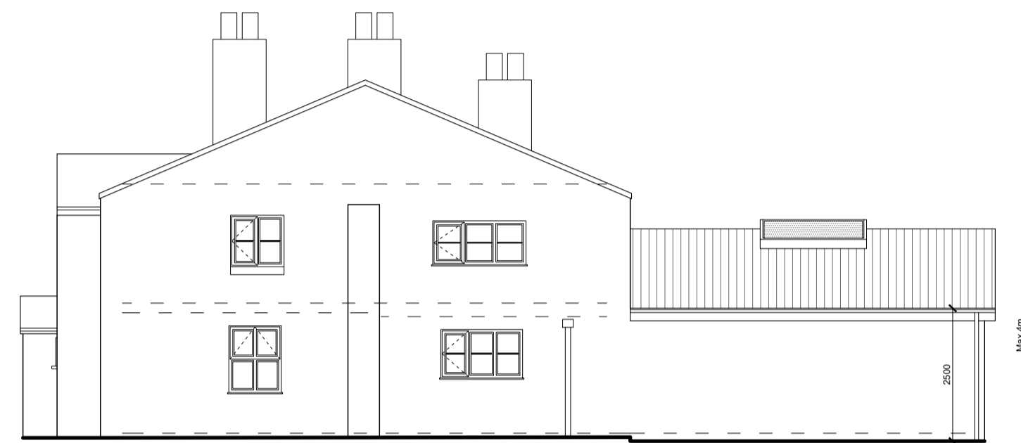
Proposed South (Side) Elevation Scale - 1:100 @ A1