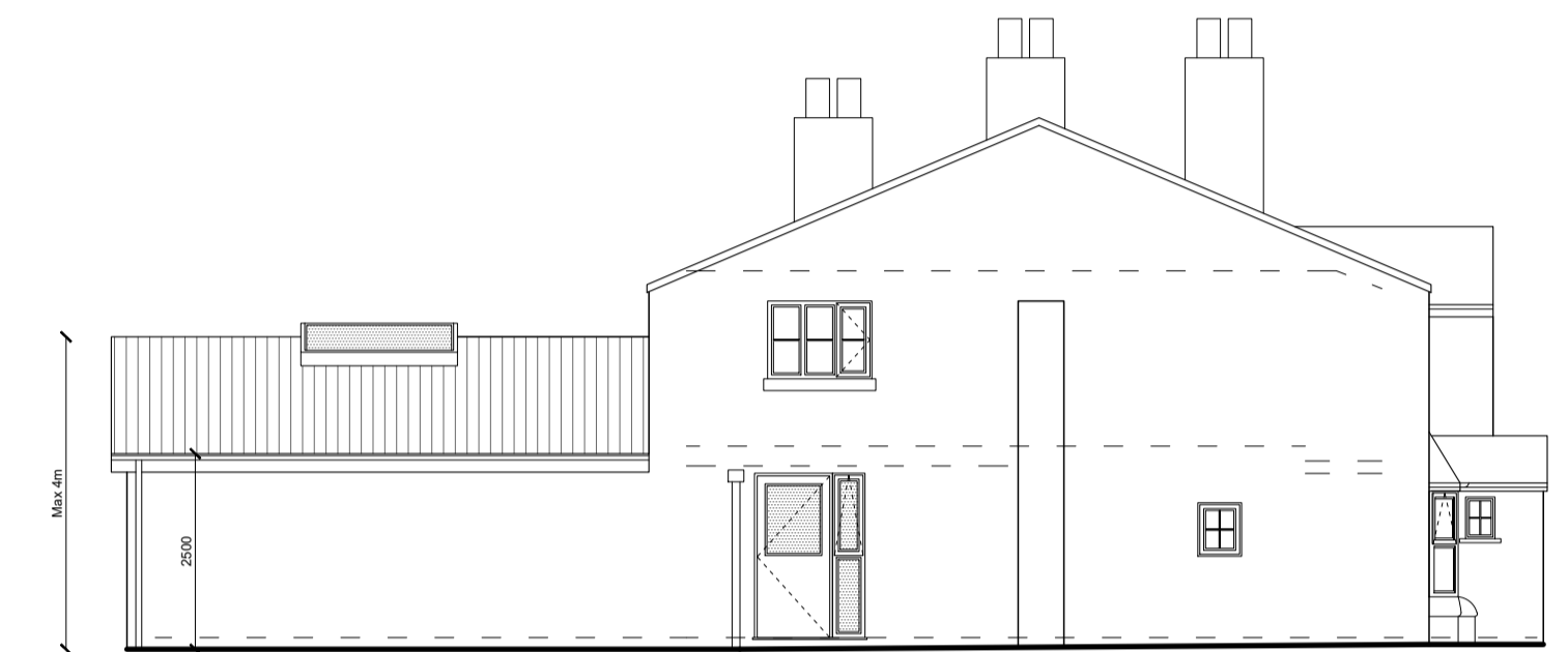
Proposed North (Side) Elevation Scale - 1:100 @ A1