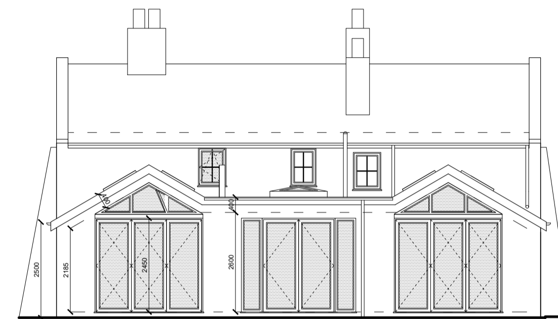
Proposed East (Rear) Elevation Scale - 1:100 @ A1