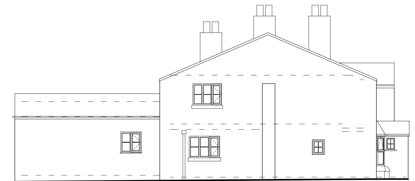
Existing North (Side) Elevation Scale - 1:100 @ A1