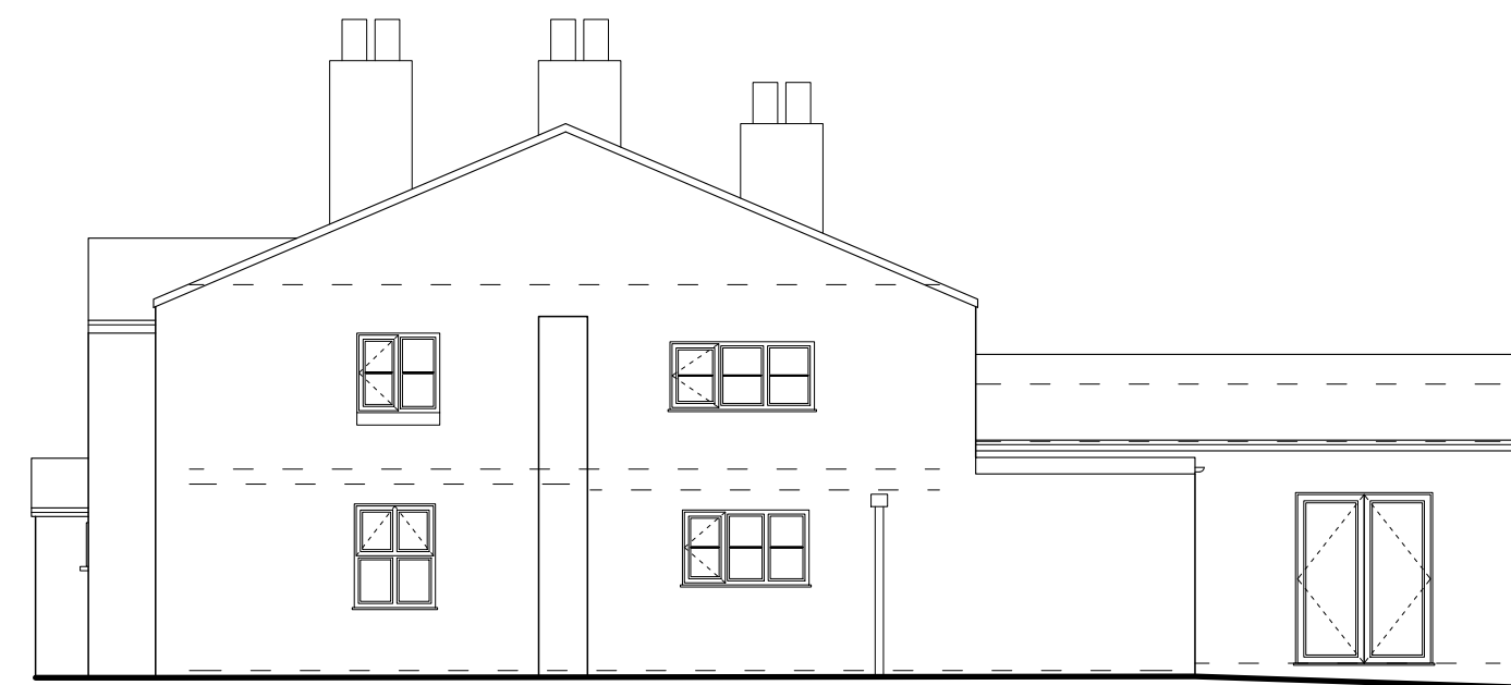
Existing South (Side) Elevation Scale - 1:100 @ A1