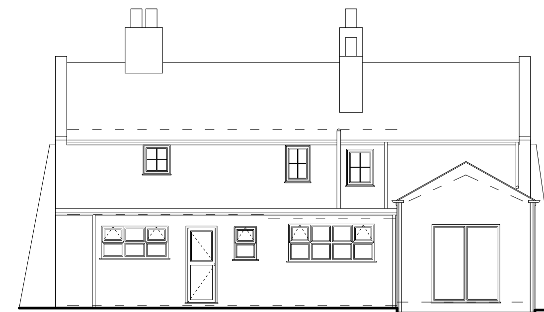
Existing East (Rear) Elevation Scale - 1:100 @ A1