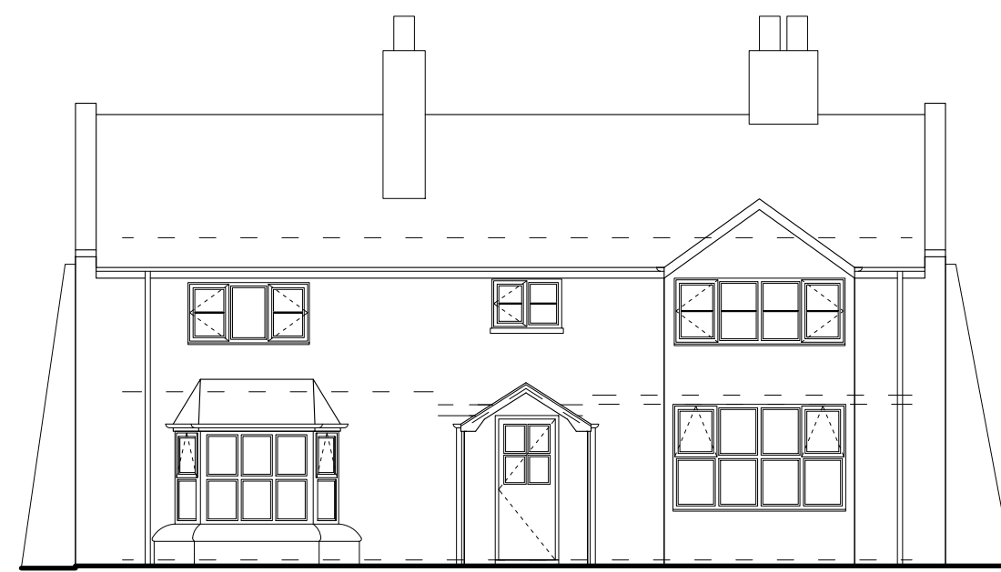
Existing West (Front) Elevation Scale - 1:100 @ A1

Sketch scheme subject to further revisions and amendments following consultation with Planning, Building Control and Specialist Consultants.