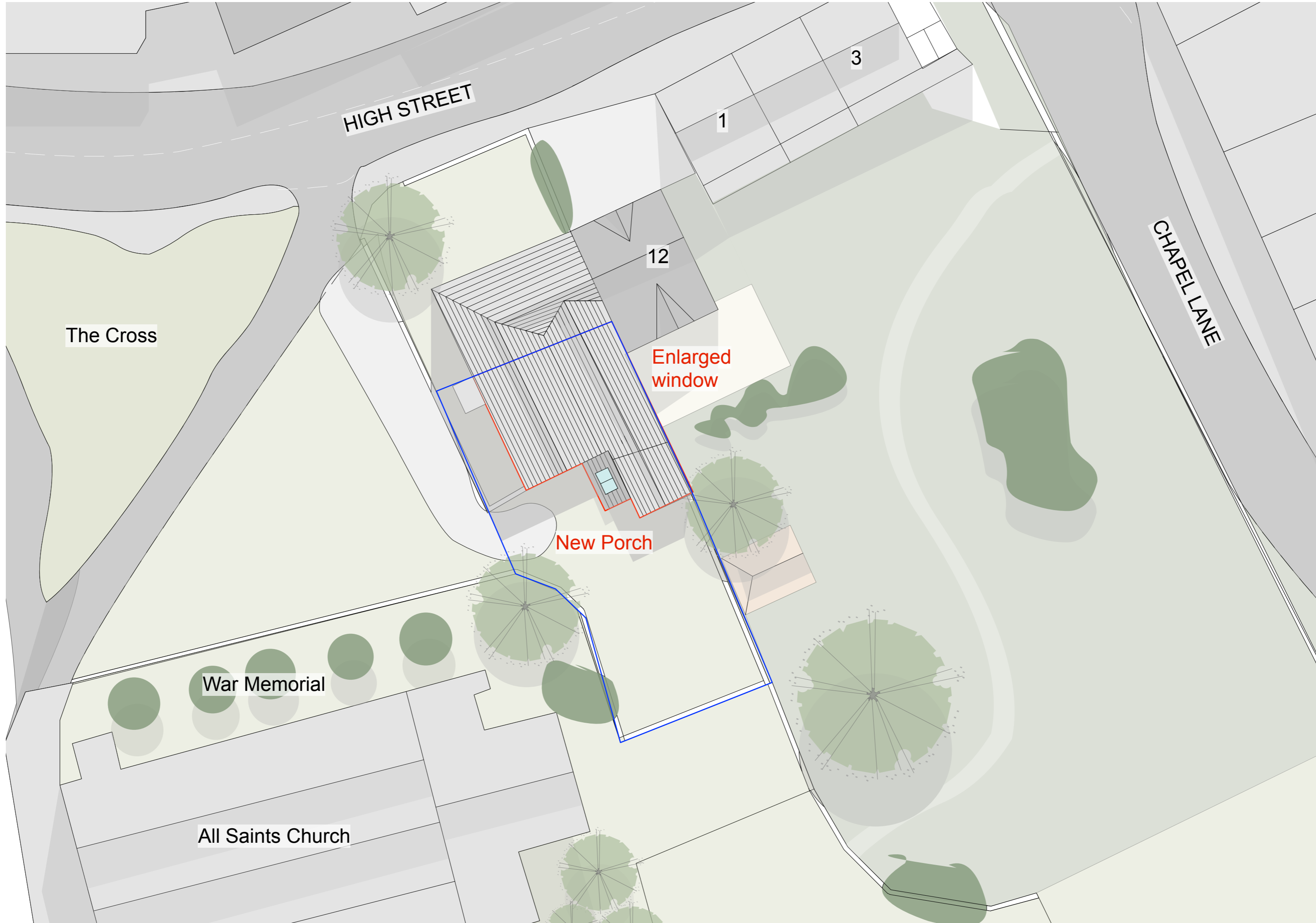
2 SITE PLAN as Proposed 1:200