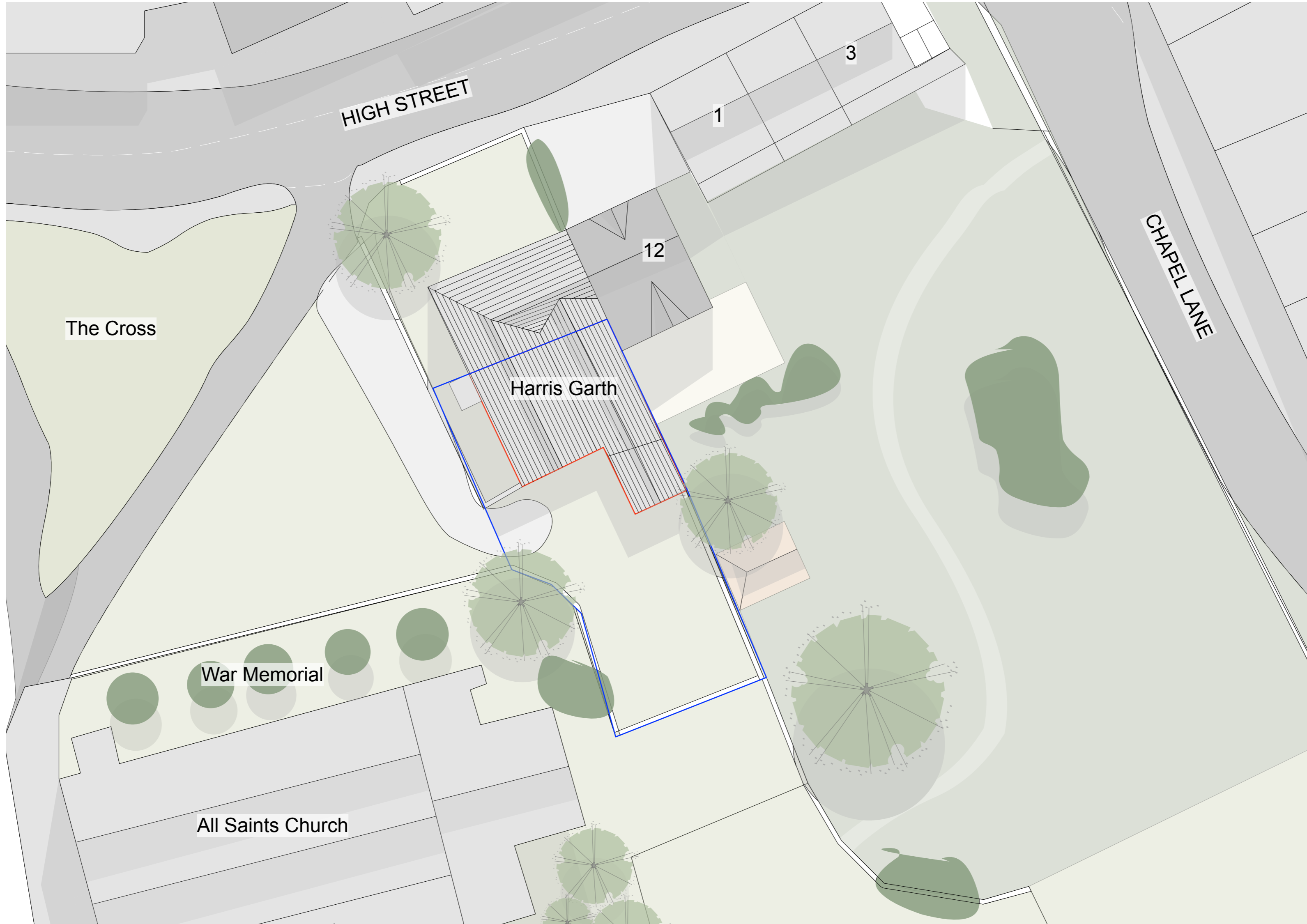
2 SITE PLAN as Existing 1:200