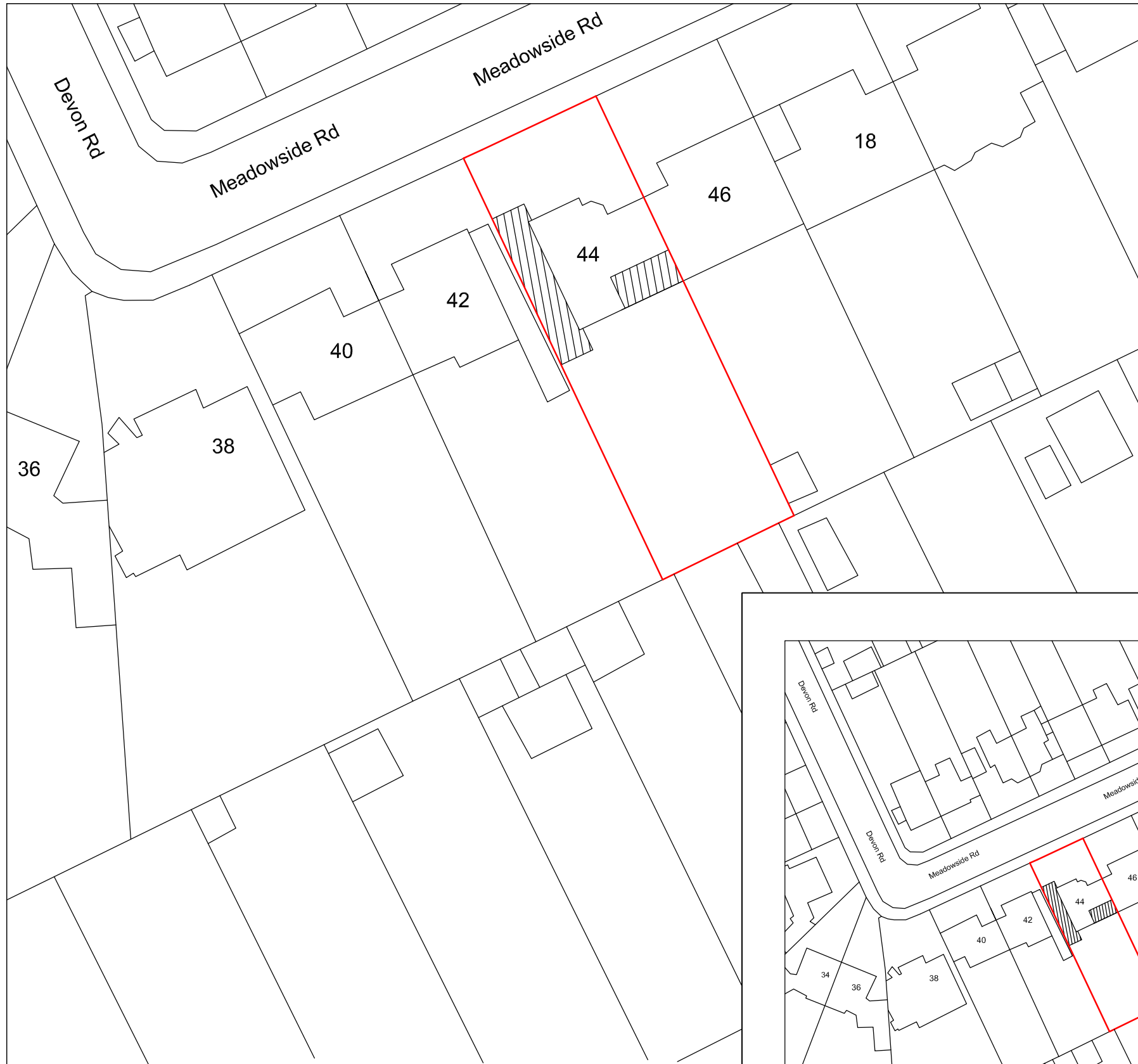
SITE BLOCK PLAN SCALE 1:500