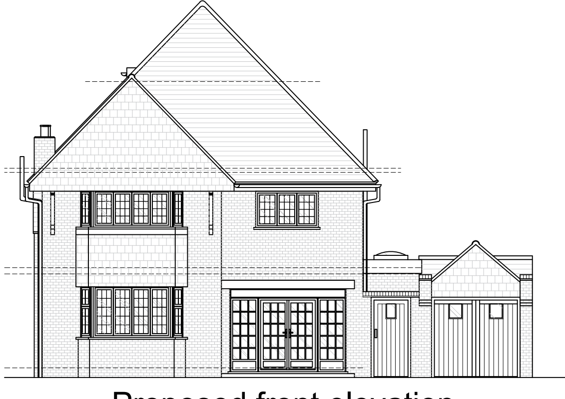
Proposed front elevation Scale 1:100