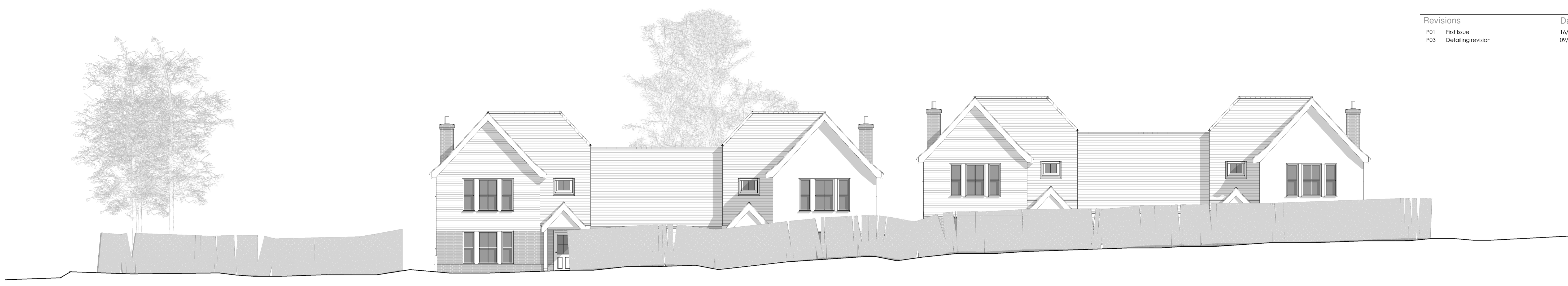
Proposed Powney Street Scene