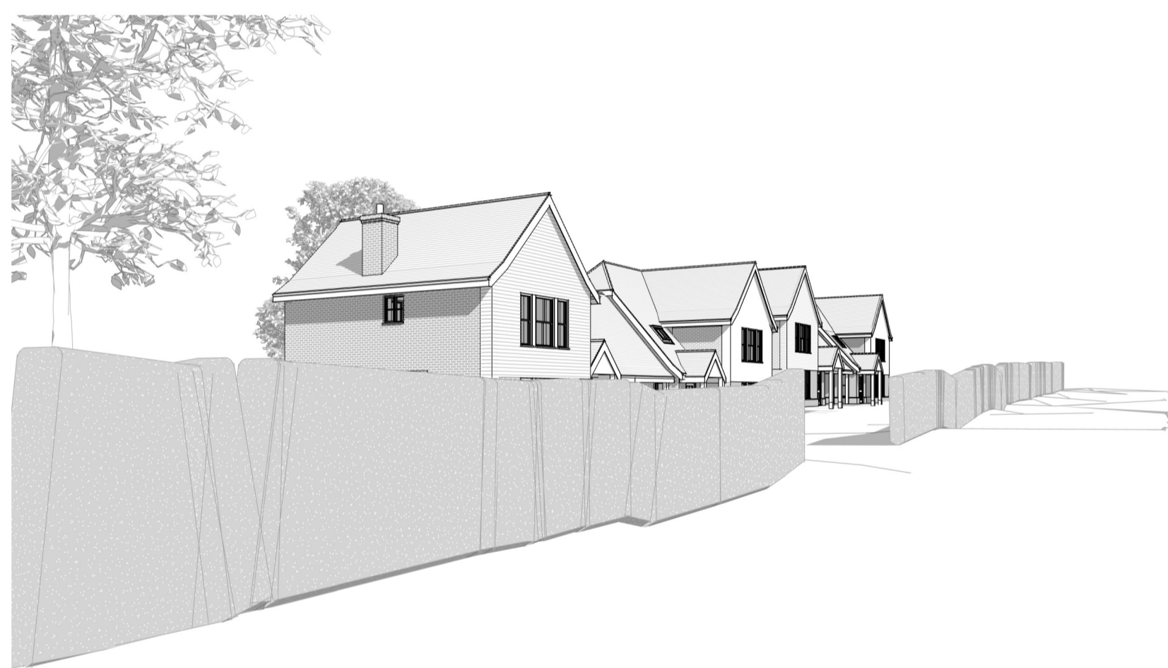
Materiality of House Type A - Plot 1 & 3