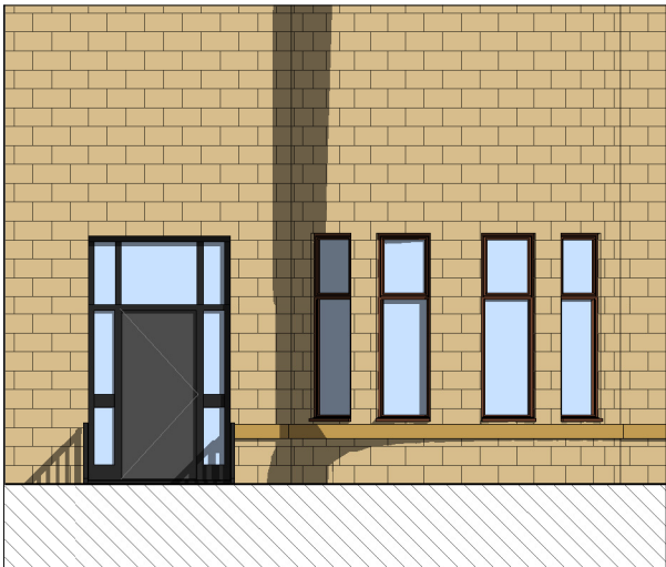
1 FRONT ELEVATION - AS EXISTING 1:100