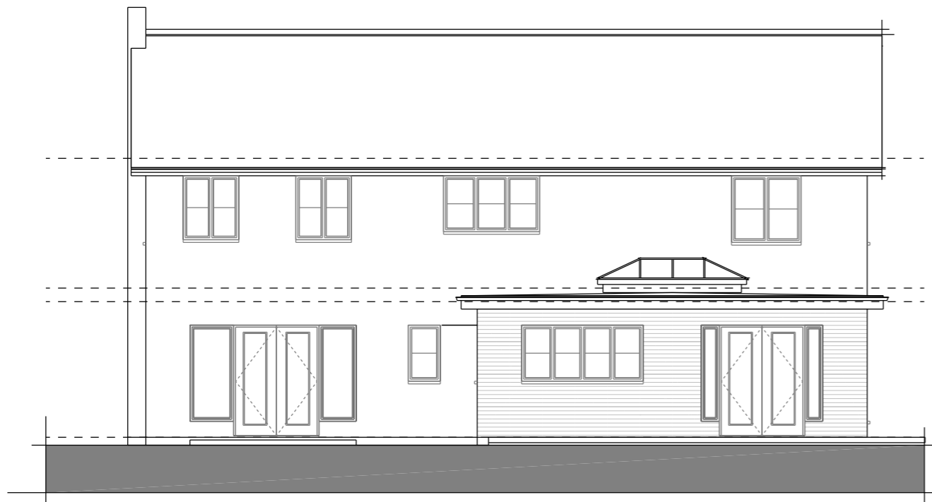
PROPOSED REAR ELEVATION - NORTH