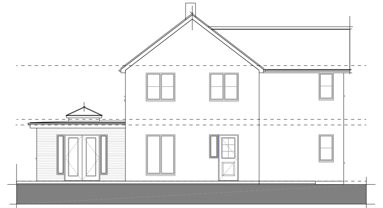
PROPOSED SIDE ELEVATION - WEST

PROPOSED ELEVATIONS - MARCH 2022 - DWG NO. ADP/1222/P/04