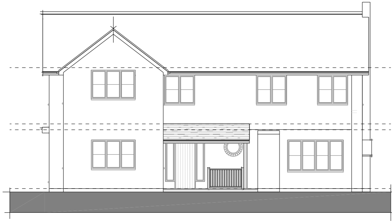
PROPOSED FRONT ELEVATION - SOUTH