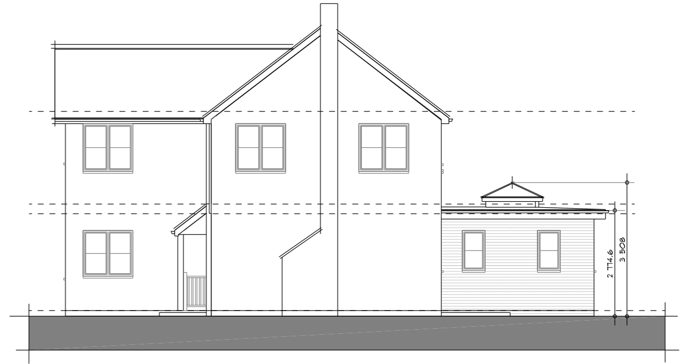
PROPOSED SIDE ELEVATION - EAST