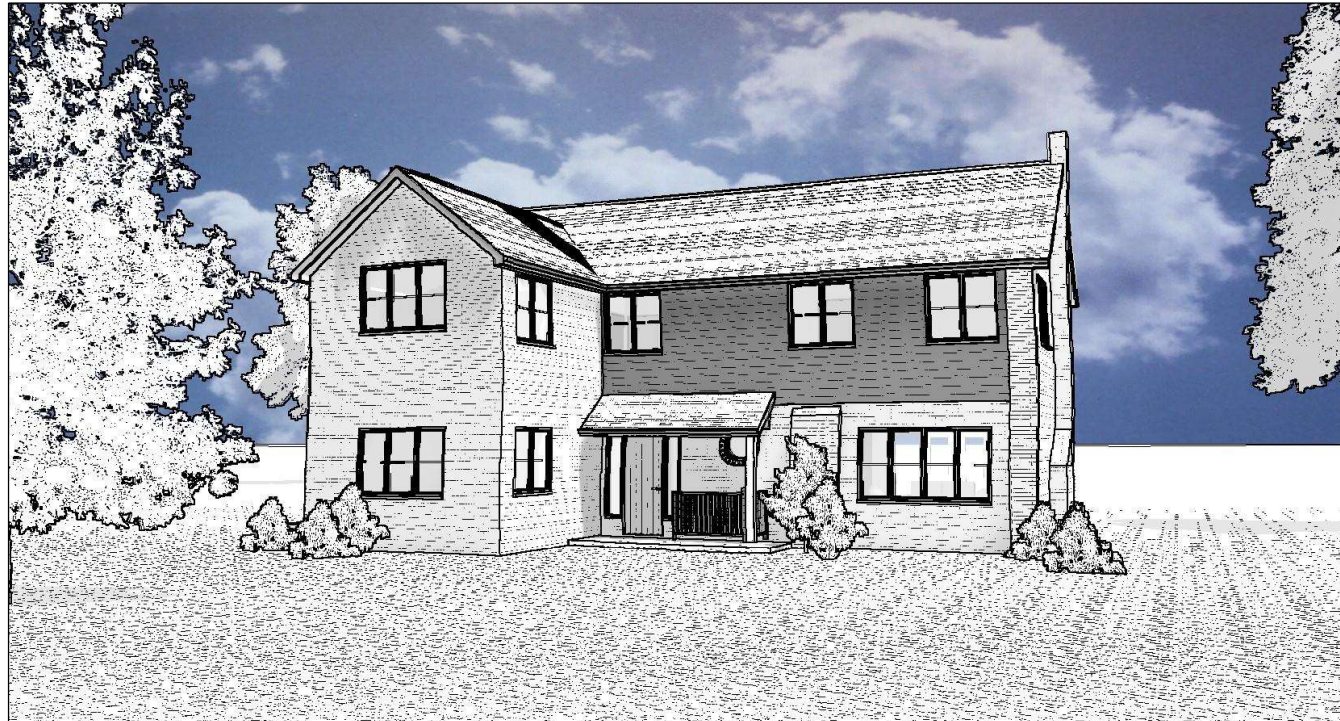
PROPOSED FRONT - SOUTH - 3D IMAGE