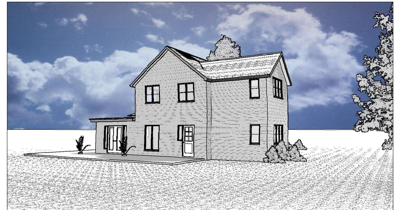
PROPOSED SIDE - WEST - 3D IMAGE

PROPOSED 3D IMAGES - MARCH 2022 - DWG NO. ADP/1222/P/06