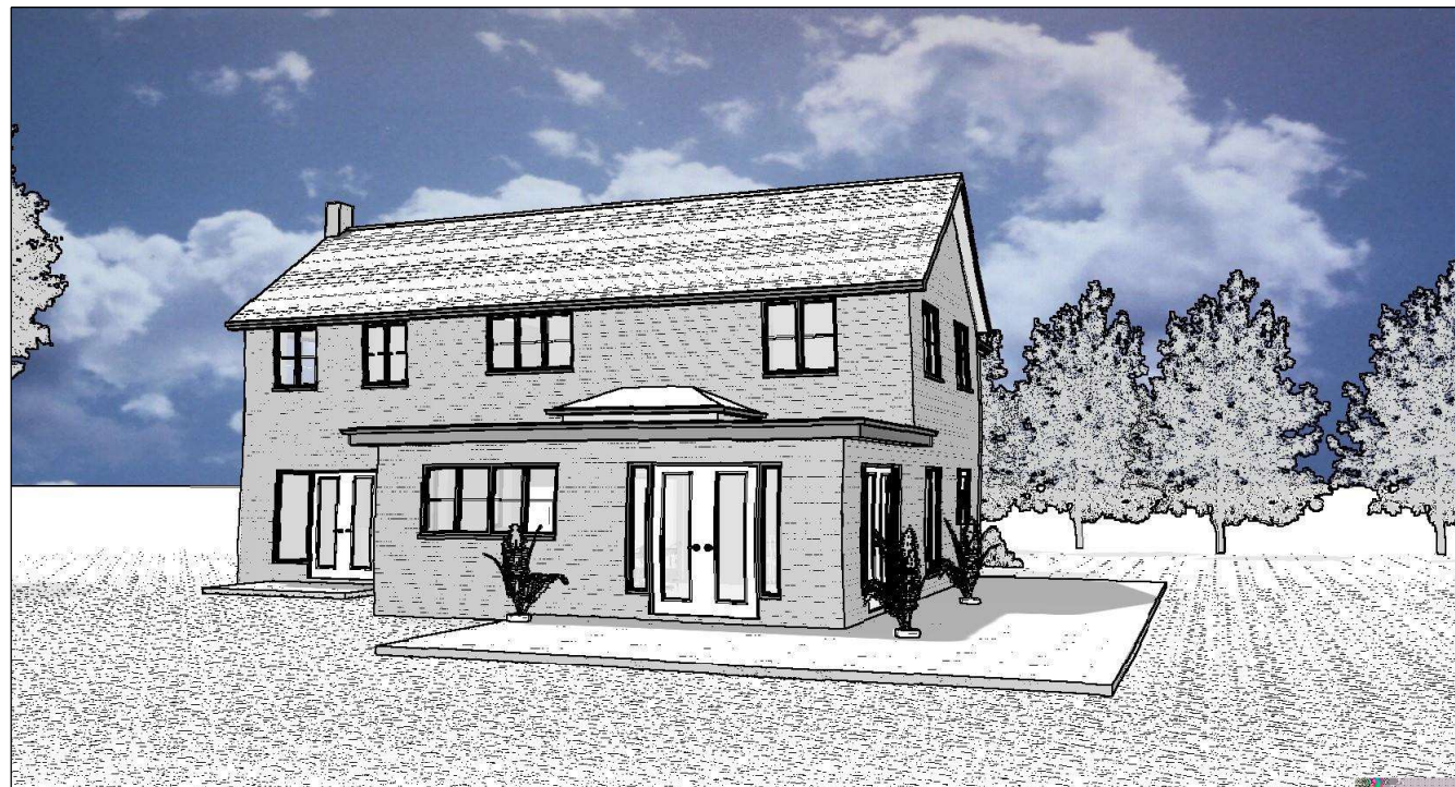
PROPOSED REAR - NORTH - 3D IMAGE