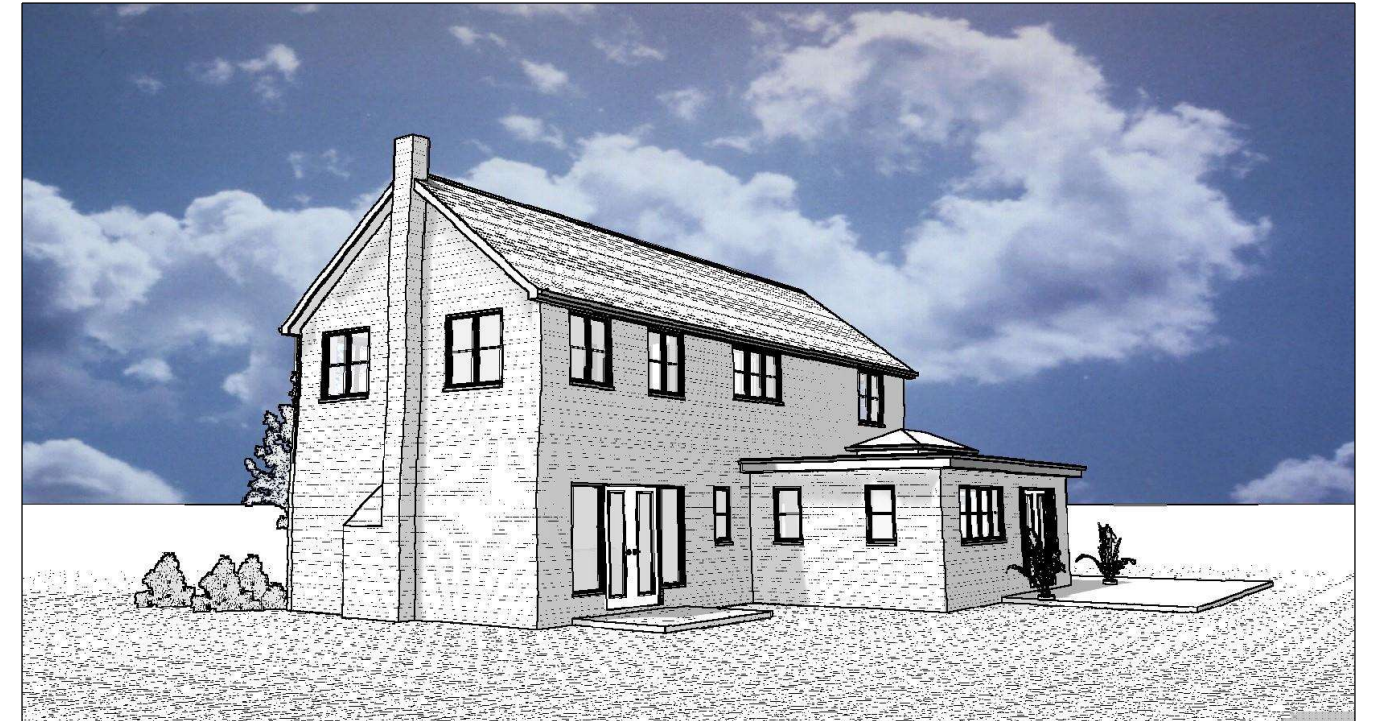
PROPOSED SIDE - EAST - 3D IMAGE