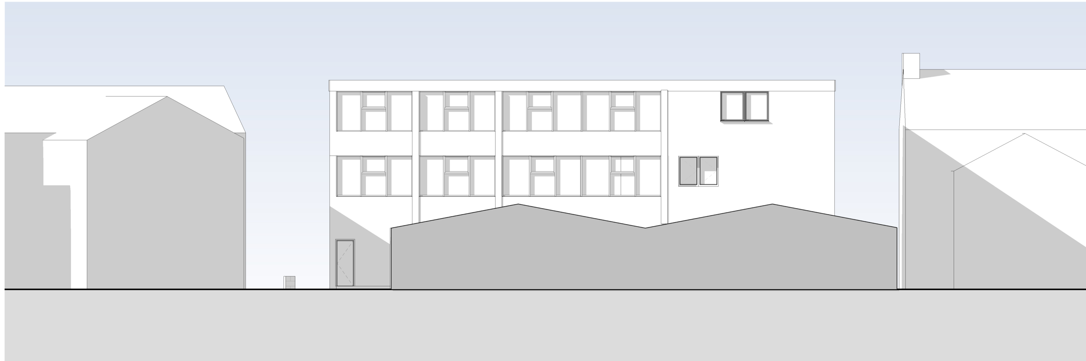
1 | JC00 - East Elevation 1:100