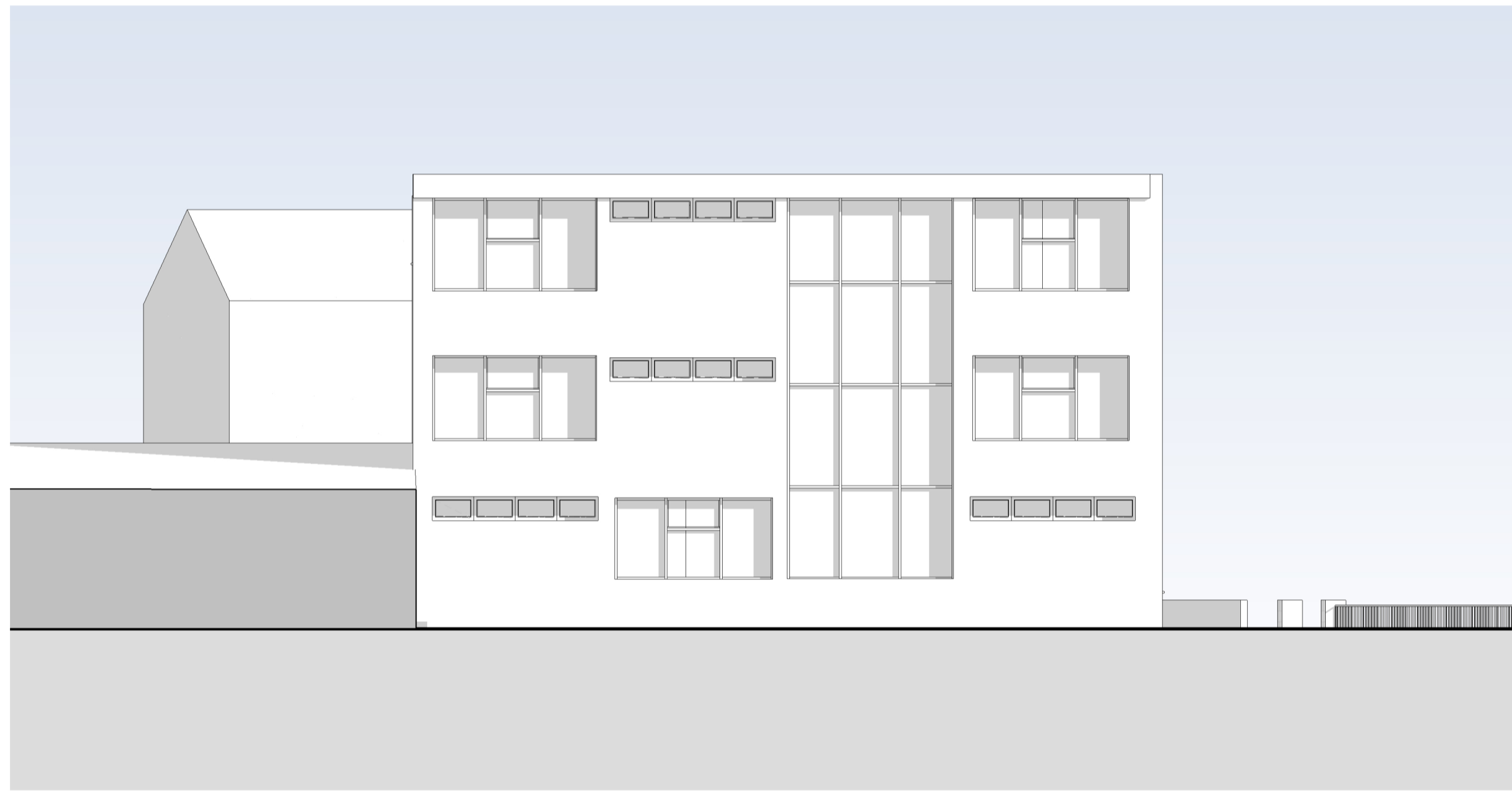
2 | JC00 - North Elevation 1:100