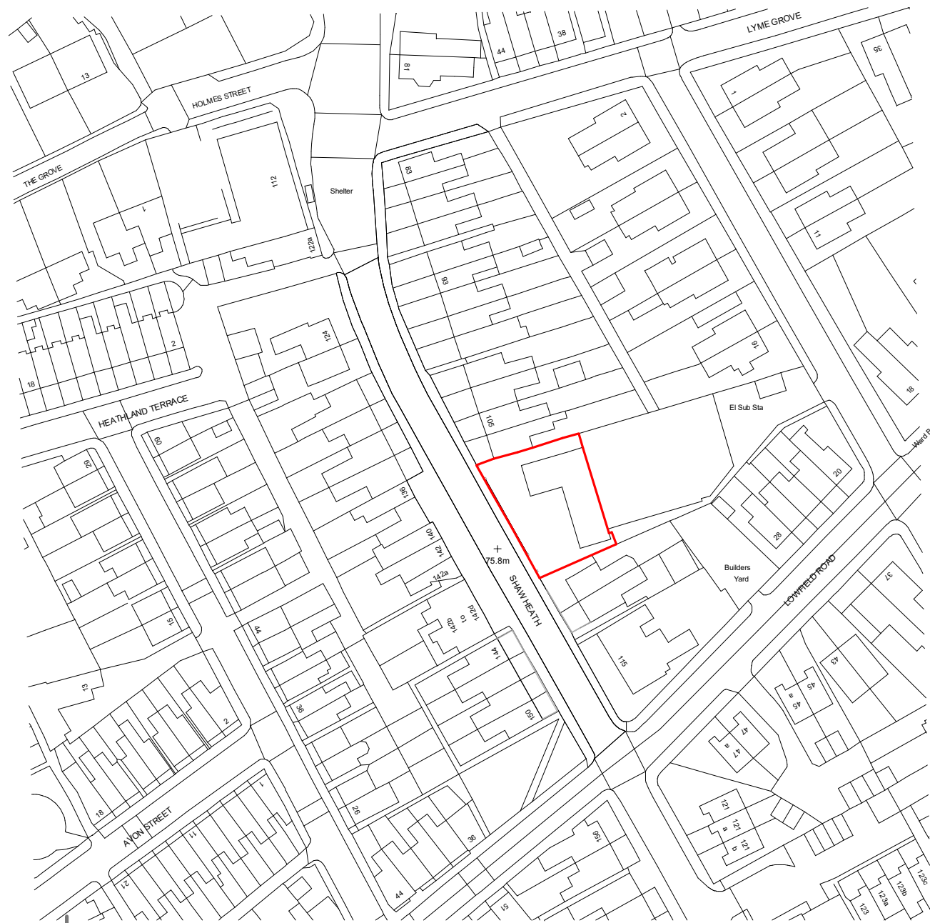
1 | G100 - Site Location Plan